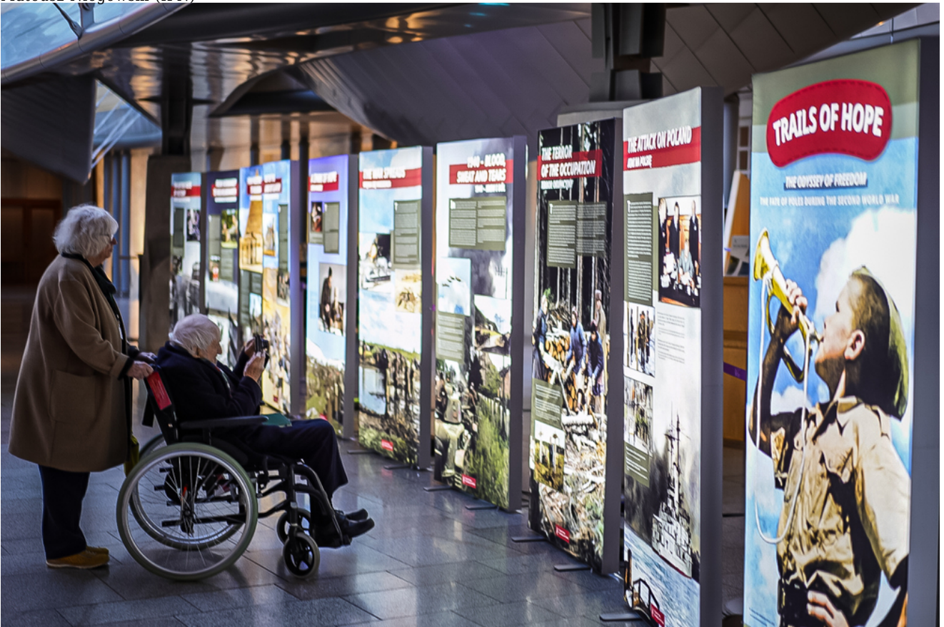
Otwarcie wystawy IPN „Szlaki Nadziei. Odyseja Wolności” w Parlamencie Szkockim, Edynburg, 13 marca 2026 r.