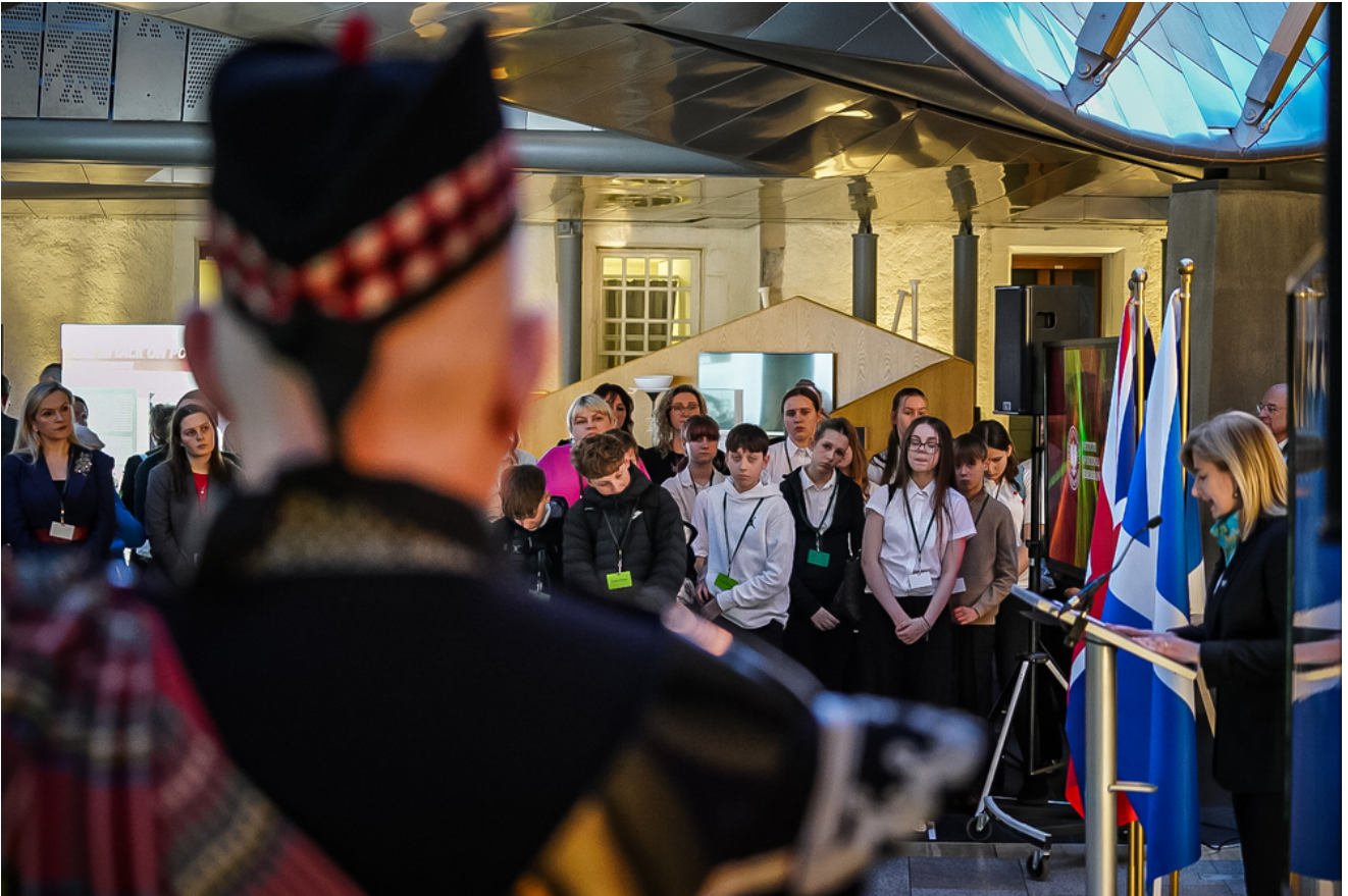
Otwarcie wystawy IPN „Szlaki Nadziei. Odyseja Wolności” w Parlamencie Szkockim, Edynburg, 13 marca 2026 r.