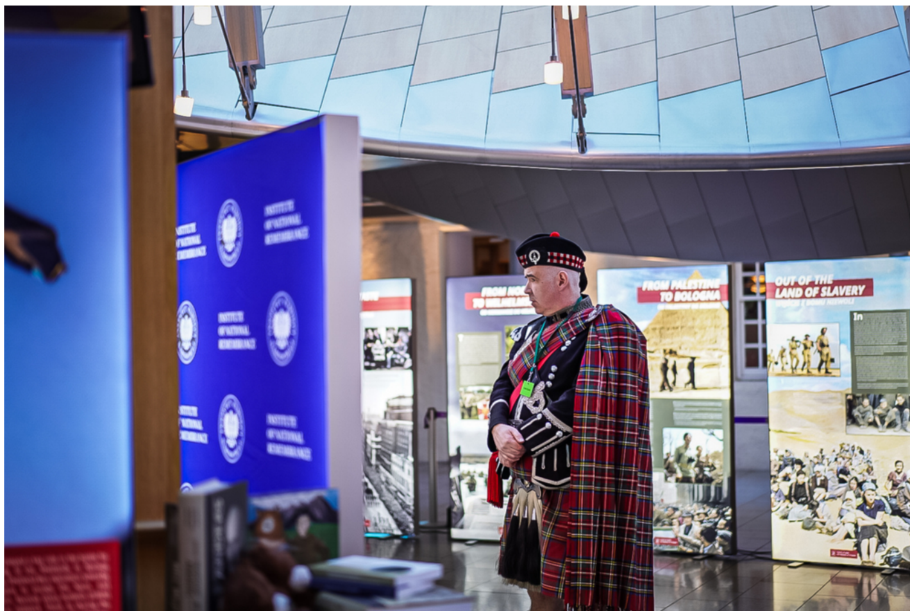
Otwarcie wystawy IPN „Szlaki Nadziei. Odyseja Wolności” w Parlamencie Szkockim, Edynburg, 13 marca 2026 r.