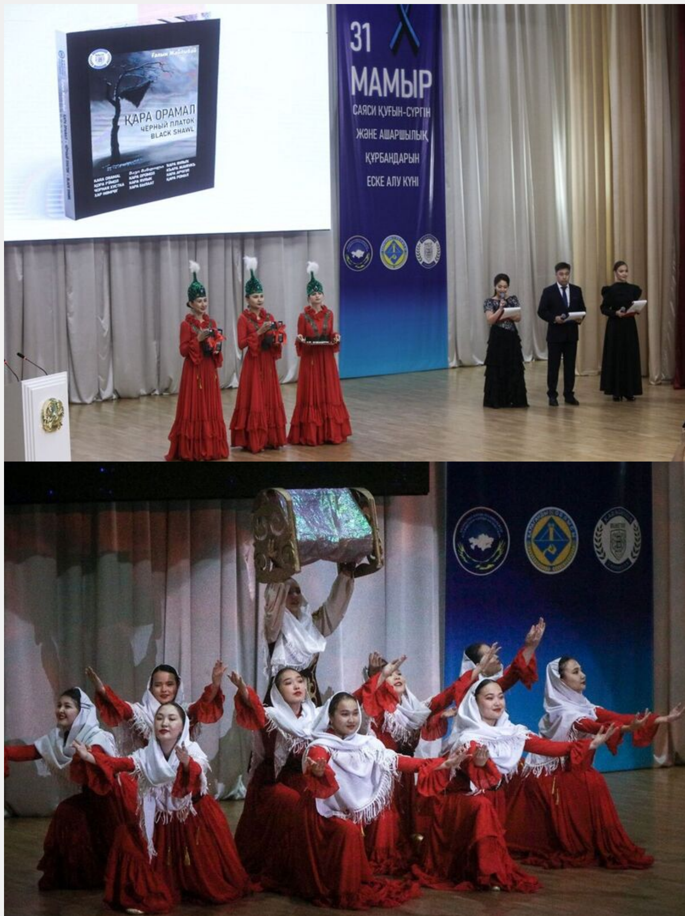
The Deputy President of the Institute of National Remembrance, Prof.