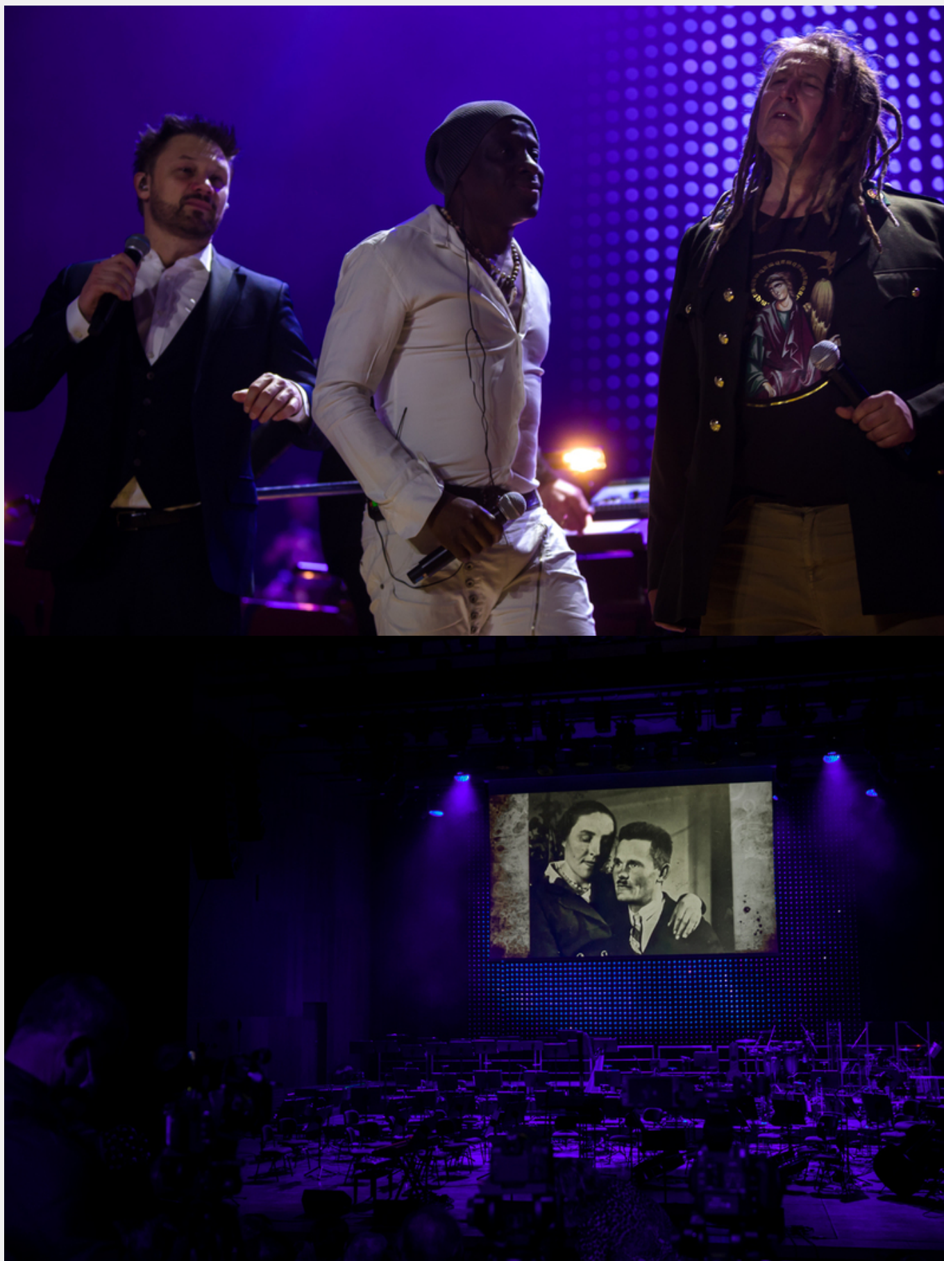
During this year's celebrations, with the participation of the Deputy