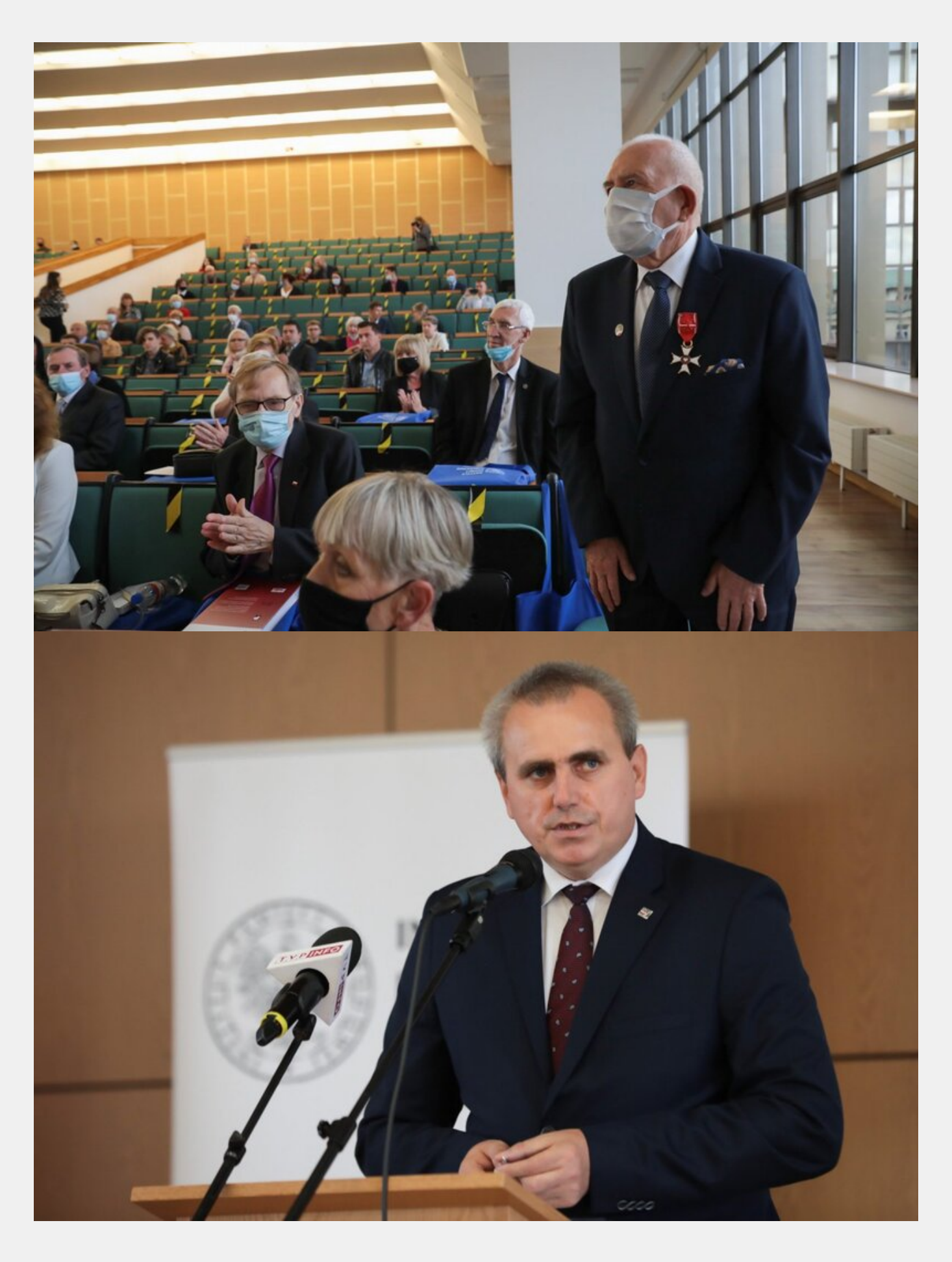
The ceremony of presenting Crosses of Freedom and Solidarity to