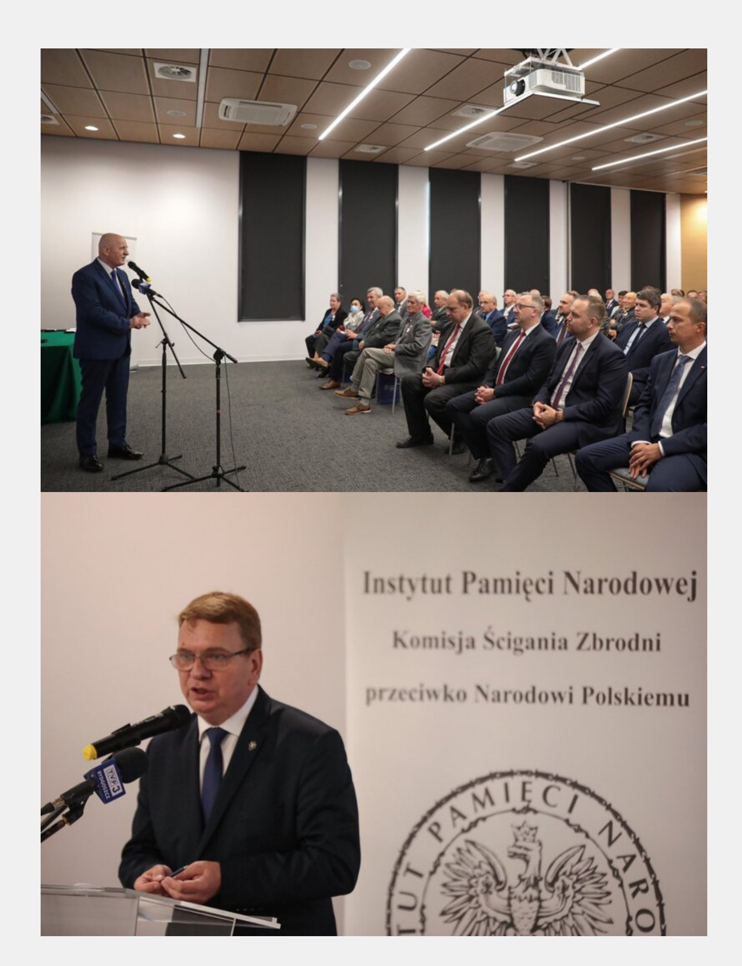
In Bydgoszcz, 57 people involved in anti-communist underground