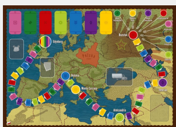
"Wojtek the Bear"