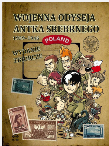
"Antek Srebrny" comic book series