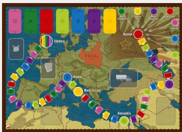
"Wojtek the Bear" board game