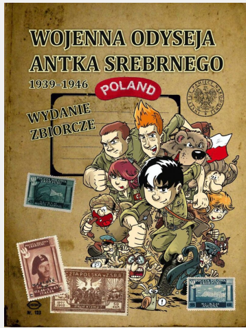
"Antek Srebrny" comic book series