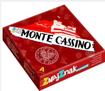
"Monte Cassino" board game