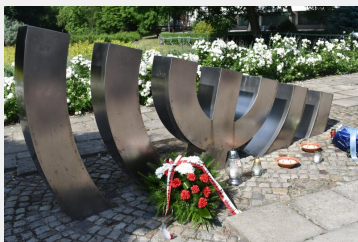
Celebrations in Kielce