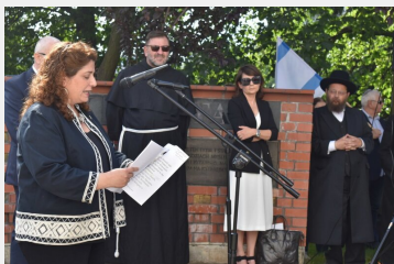
Celebrations in Kielce