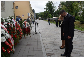
Celebrations in Kielce