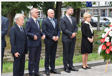
Celebrations in Kielce

were said at the graves of the victims of the Kielce pogrom. Then, the participants of the ceremony went to the Menorah Monument and the former synagogue.