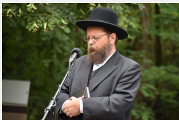
Celebrations in Kielce