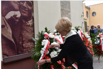
Celebrations in Kielce