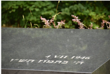
Celebrations in Kielce