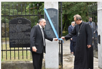
Celebrations in Kielce