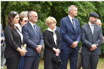
Celebrations in Kielce

The tragic events were triggered by a false rumor that a child of one of