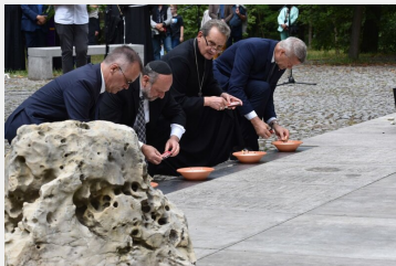
Celebrations in Kielce