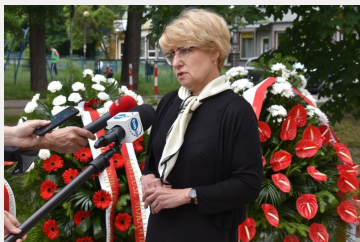
Celebrations in Kielce