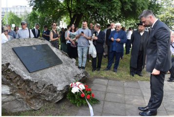
Celebrations in Kielce