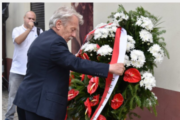
Celebrations in Kielce