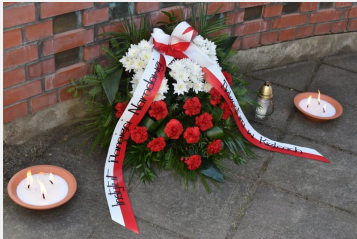
Celebrations in Kielce