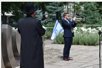
Celebrations in Kielce