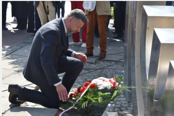
Celebrations in Kielce