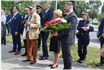
Celebrations in Kielce