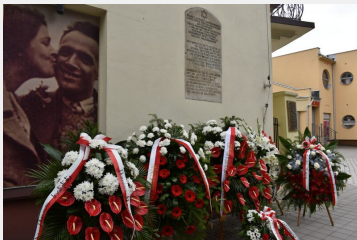
Celebrations in Kielce