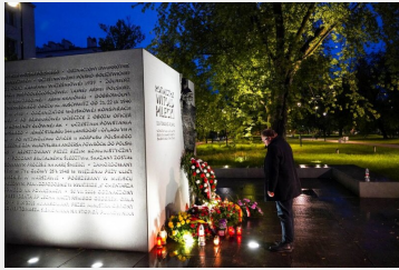
Candles in Pilecki's memory lit in Warsaw