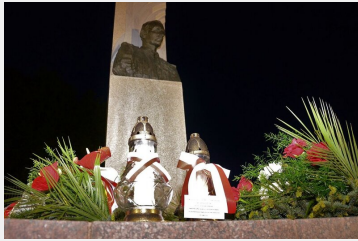
Candles in Pilecki's memory lit in Oświęcim