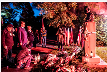
Candles in Pilecki's memory lit in Cracow