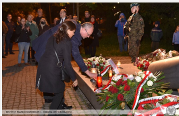
Candles in Pilecki's memory lit in Wrocław

This is what Witold Pilecki's last moments might have looked