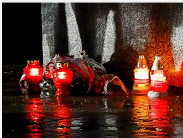
Candles in Pilecki's memory lit in Olsztyn