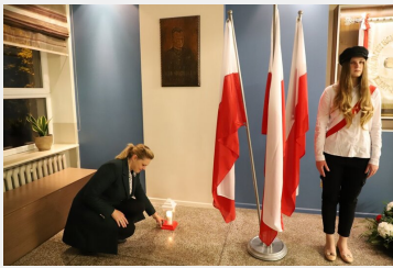
Candles in Pilecki's memory lit in Białystok