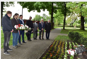
Candles in Pilecki's memory lit in Chorzów