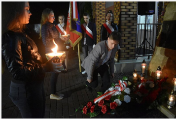
Candles in Pilecki's memory lit in Kierz Niedźwiedzi