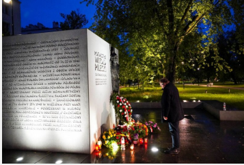
Candles in Pilecki's memory lit in Warsaw