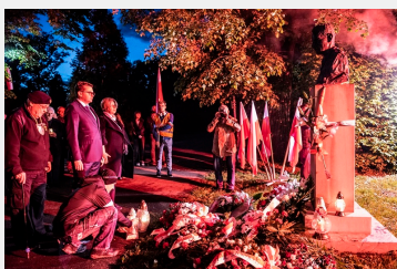
Candles in Pilecki's memory lit in Cracow