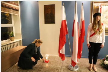
Candles in Pilecki's memory lit in Białystok