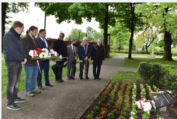
Candles in Pilecki's memory lit in Chorzów