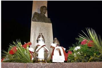
Candles in Pilecki's memory lit in Oświęcim