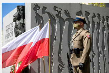
Commemorative celebrations at

The Witold Pilecki Monument on Al. Wojska Polskiego in the Żoliborz district of Warsaw, is located in the vicinity of the place where, in 1940, Pilecki voluntarily joined the round-up in order to be among the people taken to KL Auschwitz.