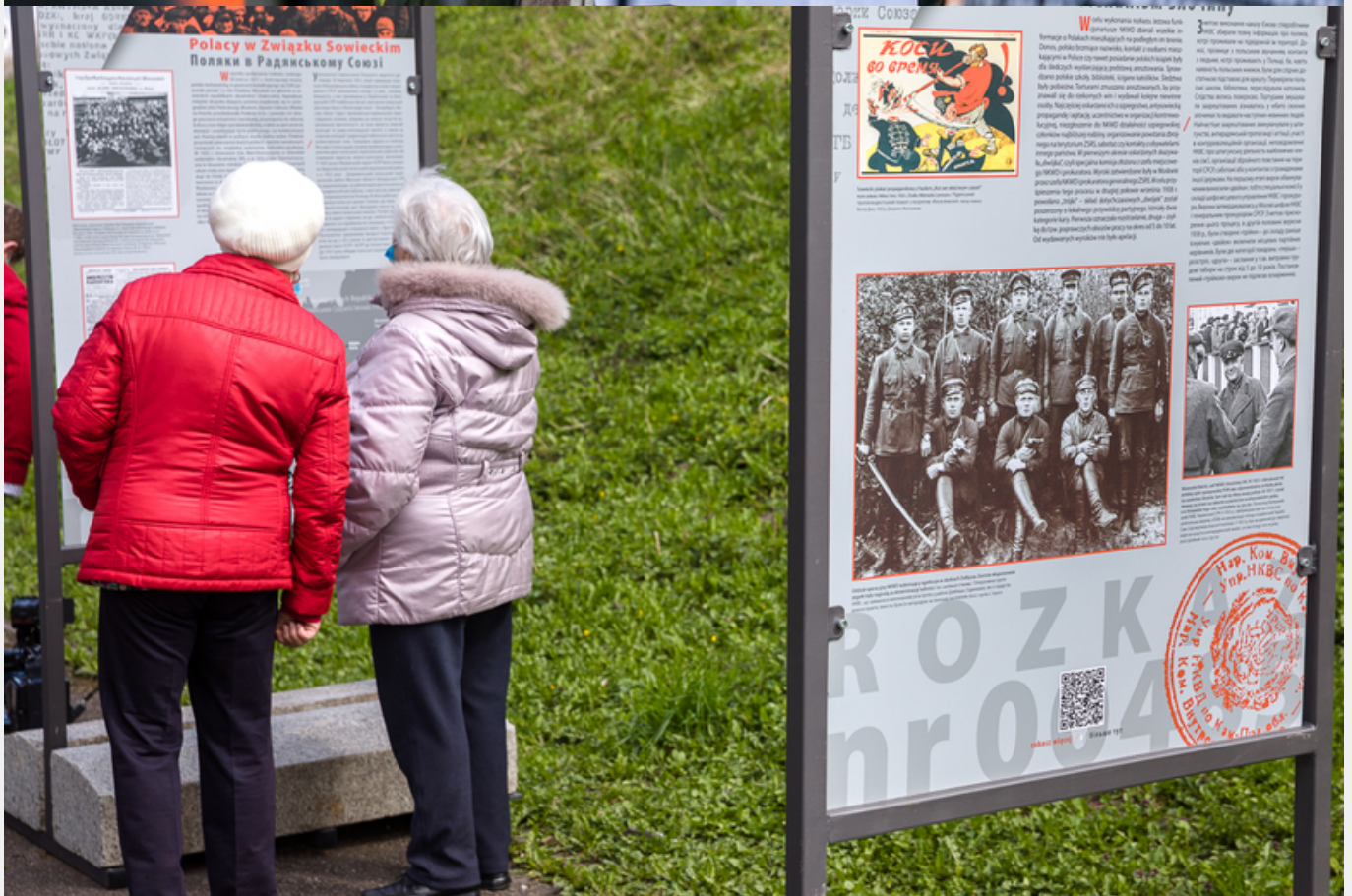
On 27 April 2021 at 11:00 a.m the President of the Institute of National