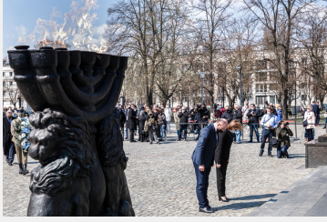
The Monument to the Warsaw Ghetto Heroes, 19 April 2021, photo Sławek Kasper IPN