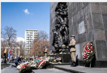
The Monument to the Warsaw Ghetto Heroes, 19 April 2021, photo Sławek Kasper IPN