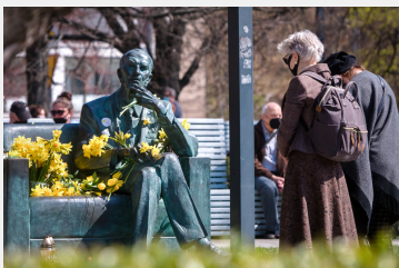
The Monument to the Warsaw Ghetto Heroes, 19 April 2021, photo