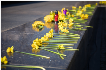
The Monument to the Warsaw Ghetto Heroes, 19 April 2021, photo Sławek Kasper IPN