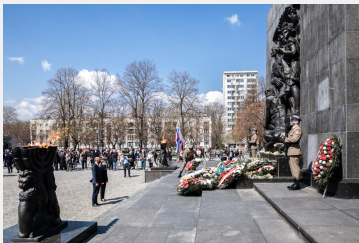
The Monument to the Warsaw Ghetto Heroes, 19 April 2021, photo Sławek Kasper IPN