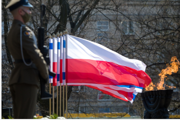
The Monument to the Warsaw Ghetto Heroes, 19 April 2021