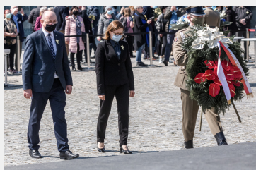
The Monument to the Warsaw Ghetto Heroes, 19 April 2021, photo Sławek Kasper IPN