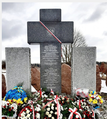
Cross at the Cemetery in Huta Pieniacka

According to estimates of the investigation carried out by the Institute of National Remembrance in Cracow, about 850 people were killed. Professor Grzegorz Motyka estimates that there were between 600 and 800 victims. The inscription on the monument in Huta Pieniacka informs about 1,000 killed Poles.