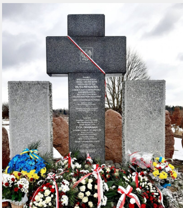
Cross at the Cemetery in Huta Pieniacka

According to estimates of the investigation carried out by the Institute of National Remembrance in Cracow, about 850 people were killed. Professor Grzegorz Motyka estimates that there were between 600 and 800 victims. The inscription on the monument in Huta Pieniacka informs about 1,000 killed Poles.