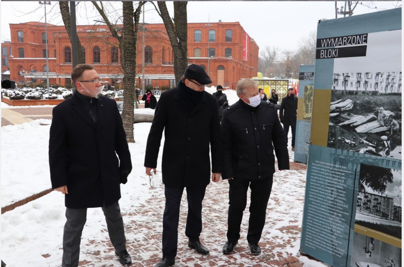
The strike of the female textile industry workers from Łódź broke out