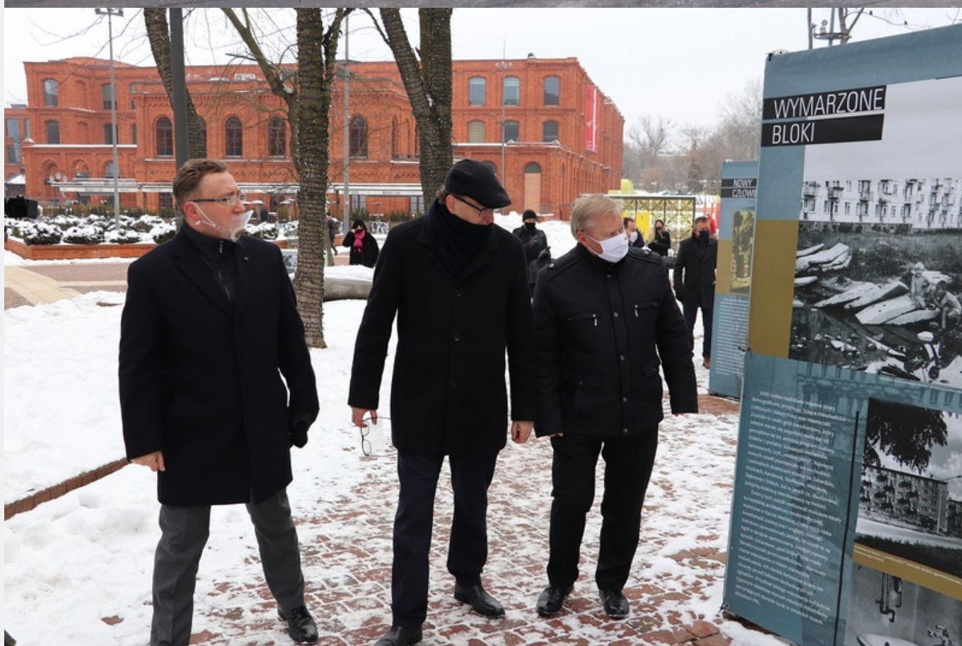
The strike of the female textile industry workers from Łódź broke out