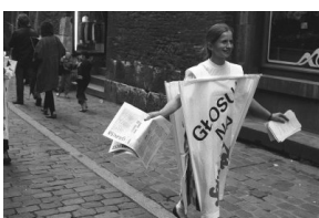
The 4 June 1989 election campaign.