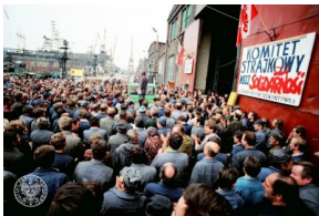
The birth of Solidarity