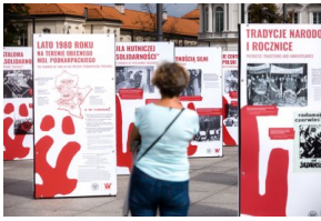
The "This is where Solidarity was born" exhibition in Warsaw