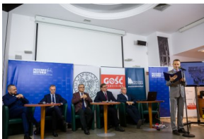
A press conference on the new portal - the "Faces of Solidarity", previously unknown Soviet documents and a press supplement, 26 August 2020, IPN's Janusz Kurtyka "History Point" Educational Centre in Warsaw

On the occasion of the 40th anniversary of the foundation of "Solidarity", the IPN's Branch in Katowice and "Gość Niedzielny", have prepared a press supplement "The August Breakthrough. The 40th anniversary of the foundation of Solidarity". The project is complemented by the "Faces of Solidarity" website. The "Faces of Solidarity" portal presents, among others the biographies of selected strike leaders from August '80, a map of strikes and agreements, unknown photos and documents, the role of John Paul II in the events of 40 years ago and an analysis of the Soviet reaction to the "Polish August".