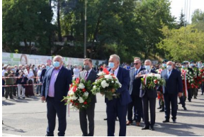
The 40th anniversary of signing the August Accords in Szczecin - Szczecin, 30 August 2020

In the summer of 1980, Szczecin became the scene of events which started the nearly ten-year gradual breakdown of communist rule in Poland. Szczecin was one of the main strike centers in which the historic Accords were signed on 30 August 1980, thus paving the way to the establishment of the Independent Self-Governing Trade Union "Solidarity" and the huge, libertarian, democratic social movement gathered around it.