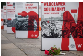
The participants of August '80 at the closing ceremony of the exhibition "This is where Solidarity was born"

The President of the Institute of National Remembrance invited the founders and members of "Solidarity" as well as anti-communist opposition activists from the 1980s to the ceremonial closing of the exhibition "This is where Solidarity was born" on Piłsudskiego Square in Warsaw on 16 October 2020.