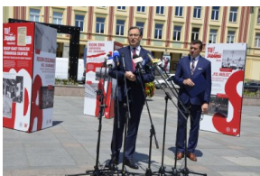
The opening of the Gdynia and Gdańsk editions of the IPN exhibition "This is where 'Solidarity' was born" - 14 August 2020

"Solidarity is needed not only by Poland, but also by today's societies and modern Europe," said the President of the Institute of National Remembrance, Jarosław Szarek, Ph.D. at the opening of the exhibition.