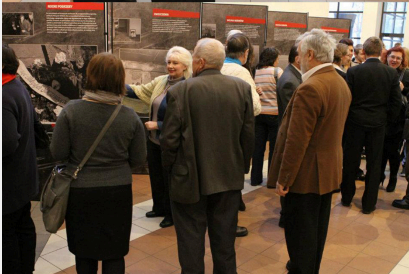
The House of Polish Culture in Vilnius, City Hall of Szczecin, House of