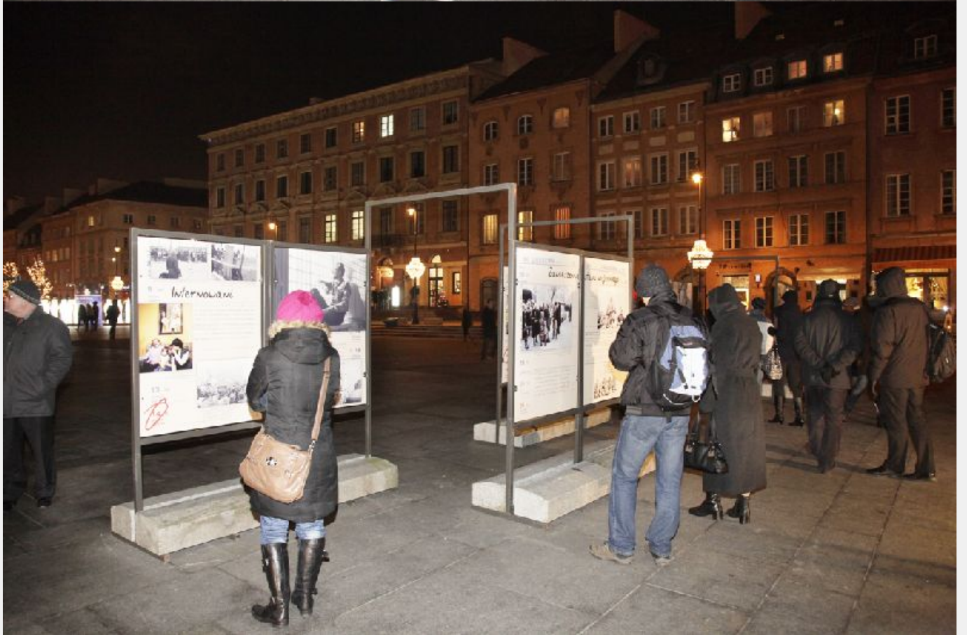
Due to the 30th anniversary of introduction of martial law in Poland,