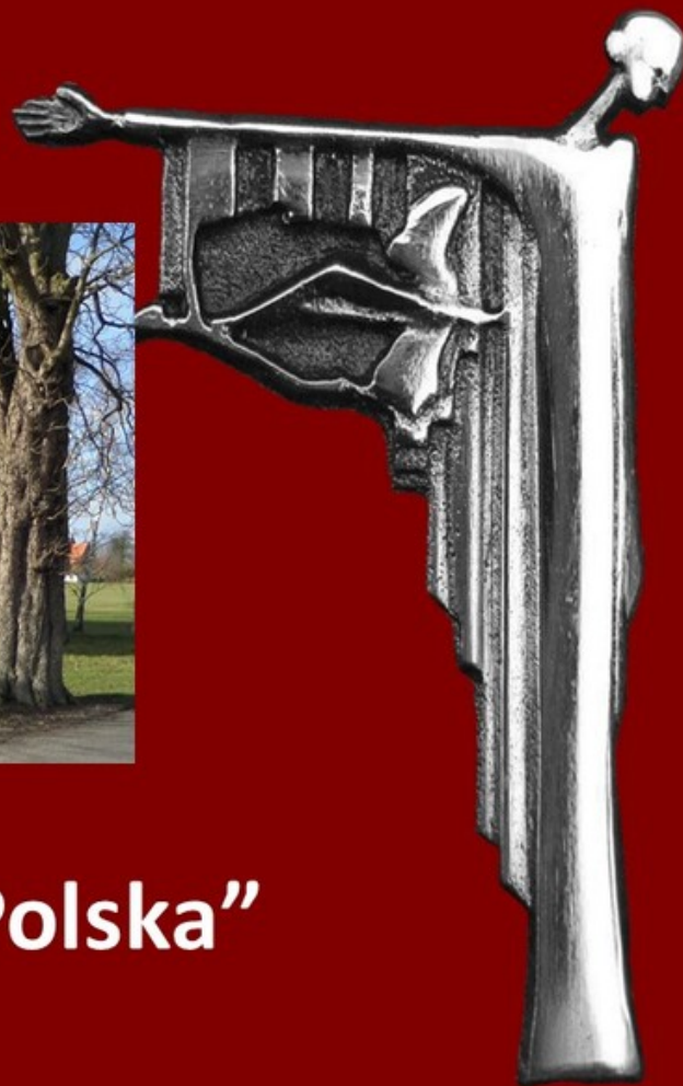
Muzeum „Izba Polska”