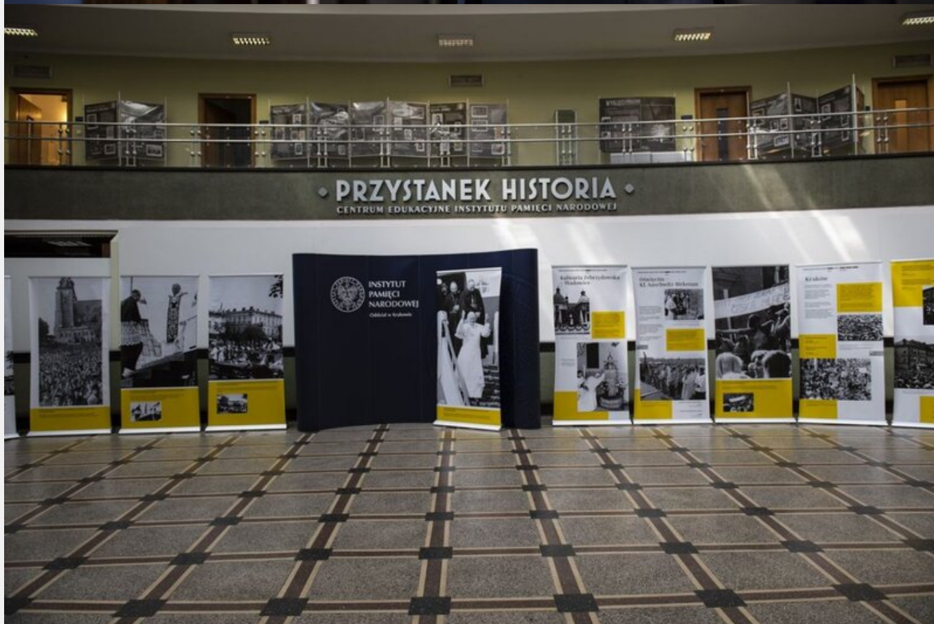
During the meeting, which was attended by the President of the IPN