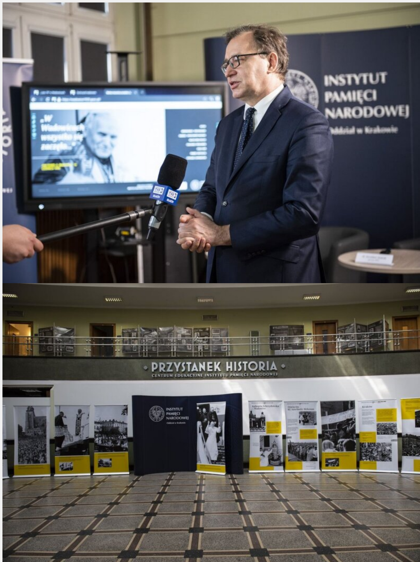
During the meeting, which was attended by the President of the IPN