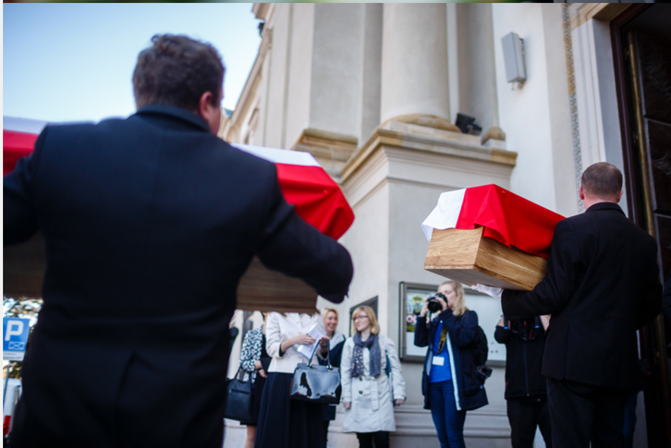
22 heroes fighting for a free Poland, murdered by the communist