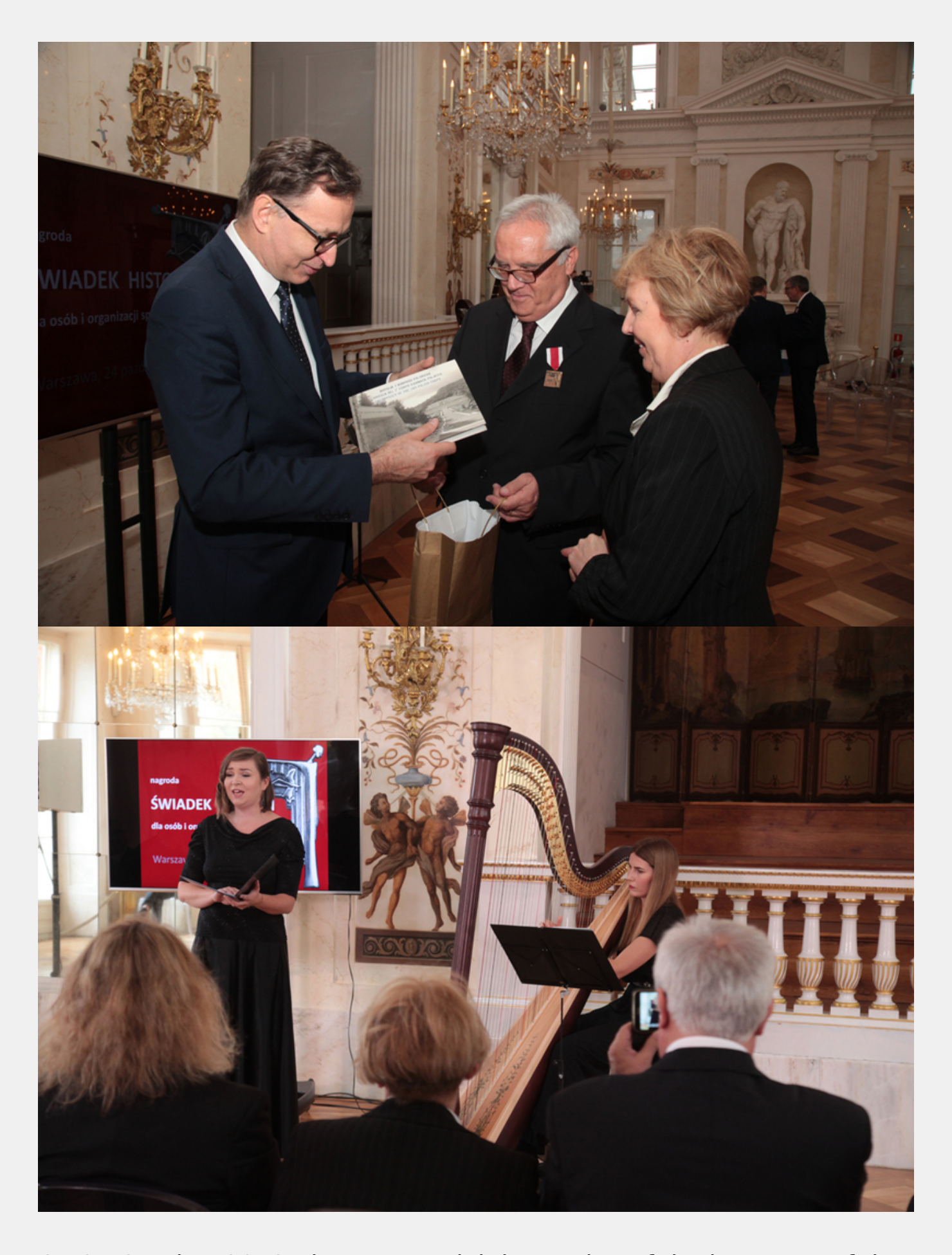
On 24 October 2018, the ceremonial decoration of the laureates of the