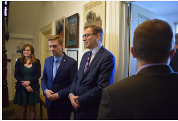
Visit to the Polish Underground Movement Study Trust