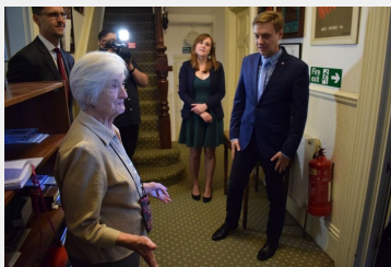
Visit to the Polish Underground Movement Study Trust