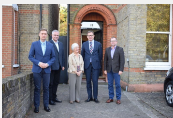
Visit to the Polish Underground Movement Study Trust

During the meeting at the SPP an agreement was signed for the joint edition of the next issue of the Information Bulletin of the Underground Poland Study. President Jarosław Szarek pointed out that although it is a small thing, it would serve historians and all interested parties.