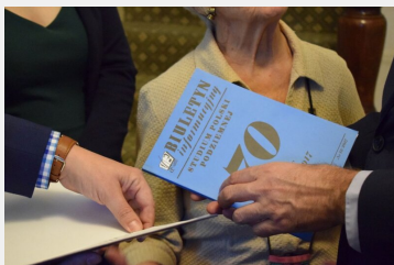
Visit to the Polish Underground Movement Study Trust