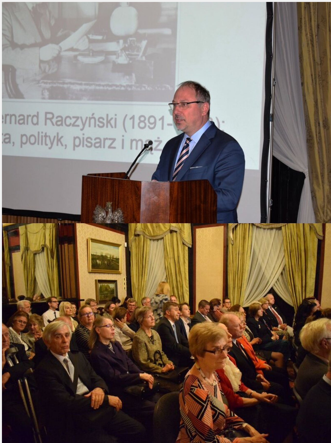
On 19-22 October, the IPN delegation headed by the President of the