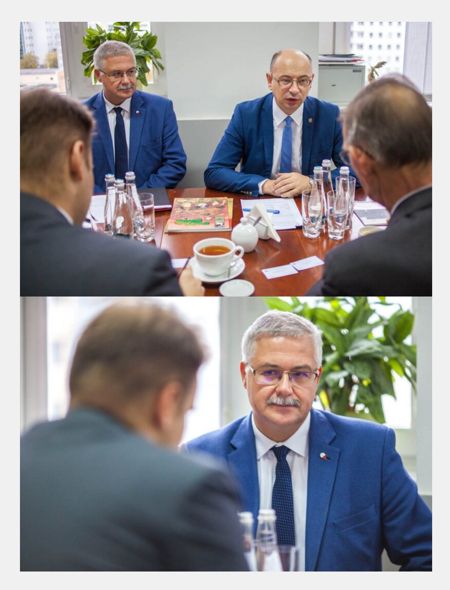
On 3 October this year the Institute of National Remembrance hosted