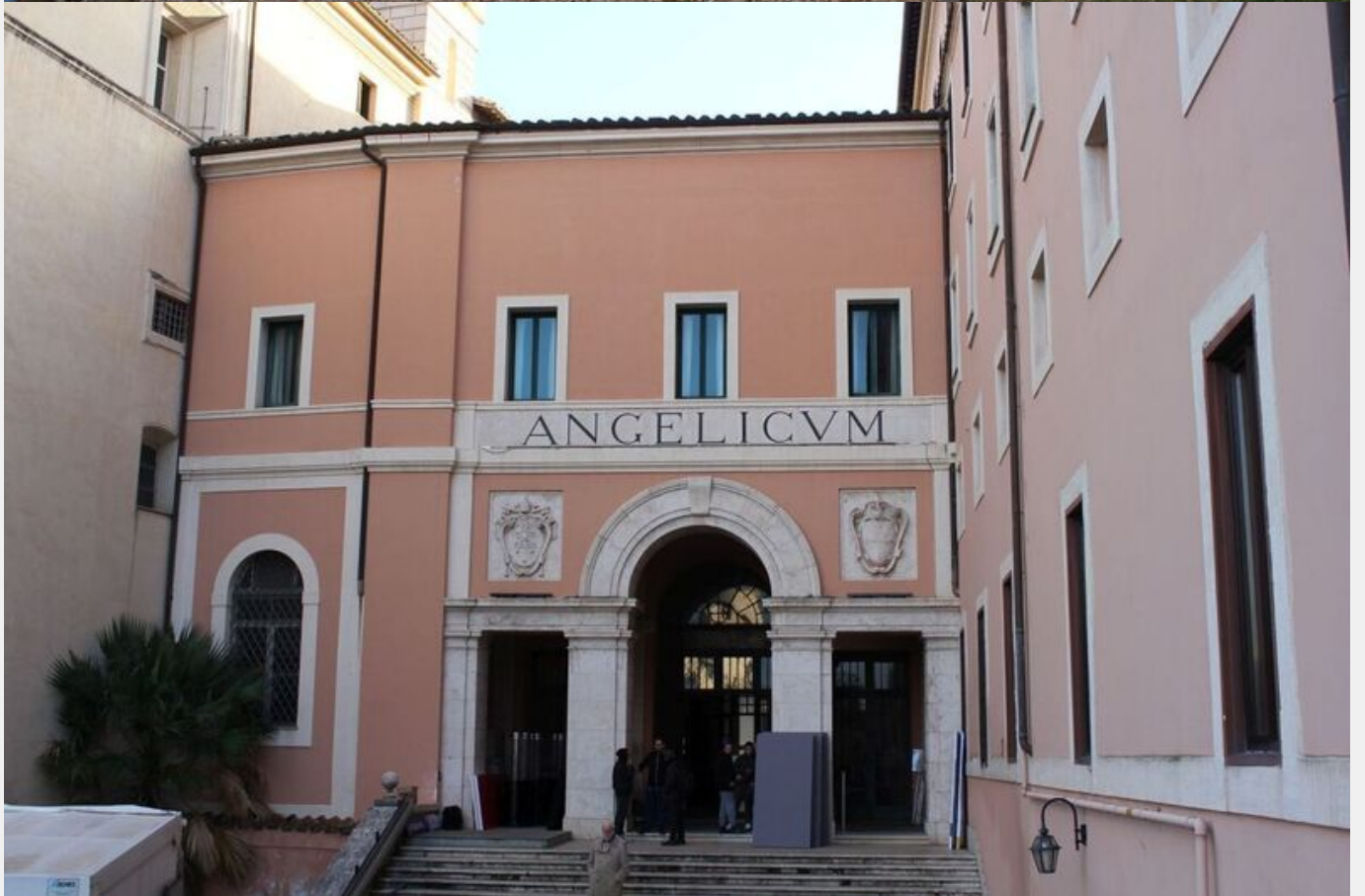
On 28 November 2023, Deputy President of the Institute of National