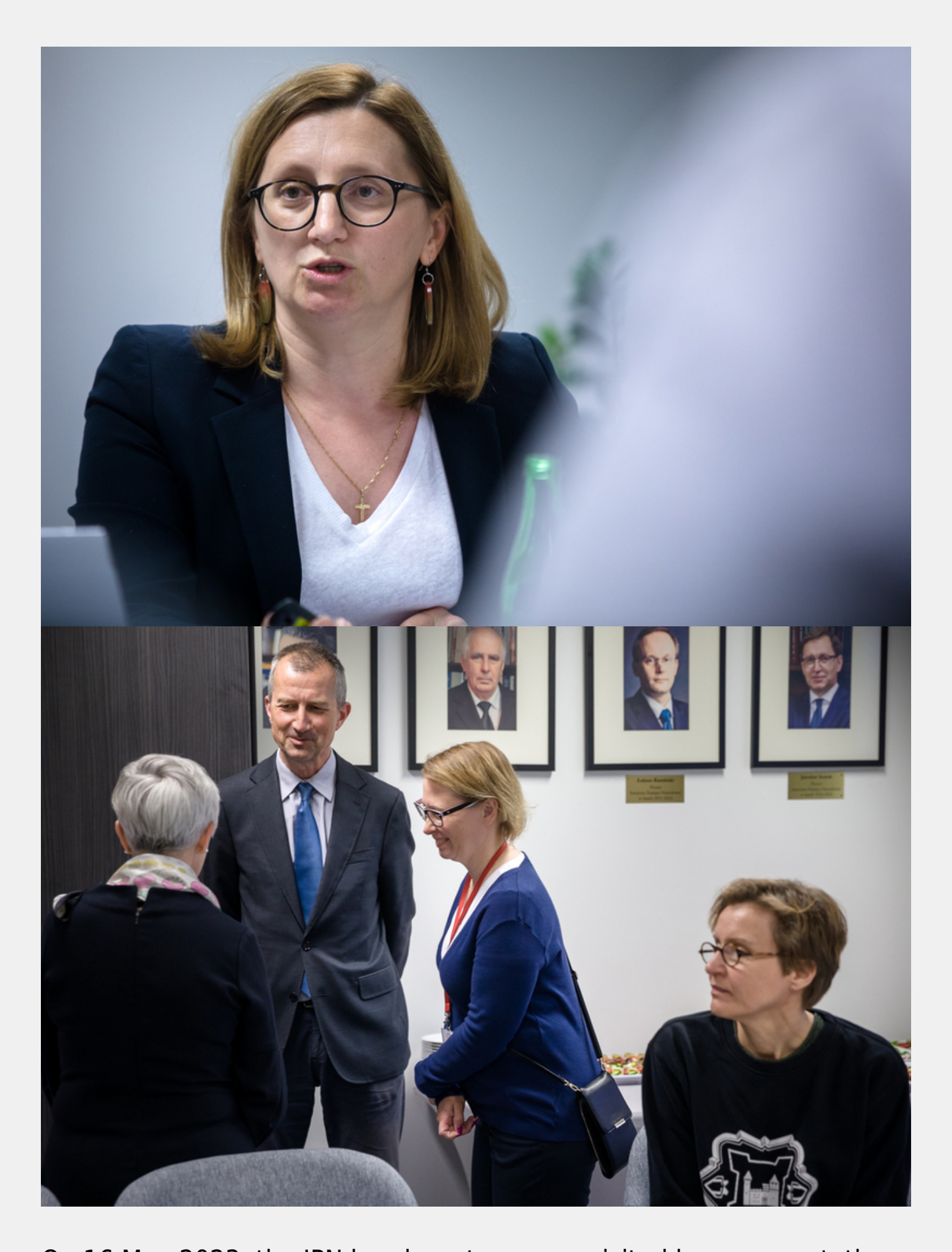
On 16 May 2023, the IPN headquarters were visited by representatives