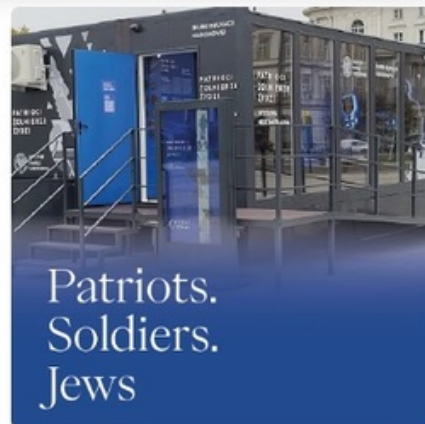
Patriots. Soldiers. Jews