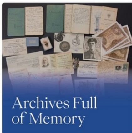
Archives Full of Memory