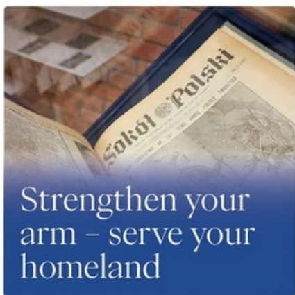
Strengthen your arm – serve your homeland