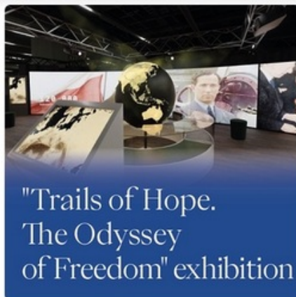
"Trails of Hope. The Odyssey of Freedom" exhibition