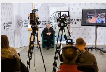
“Giants of Polish