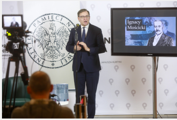
“Giants of Polish Science” press conference