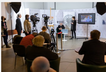
“Giants of Polish Science” Press Conference; 04.02.2020