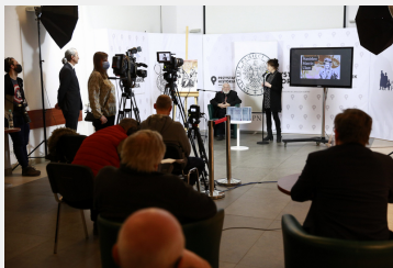
“Giants of Polish Science”