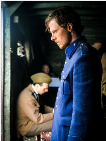
Photo from the film