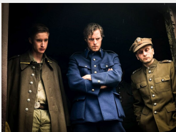
Photo from the film