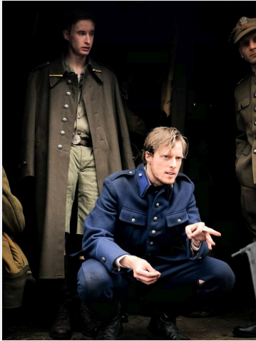
Photo from the film