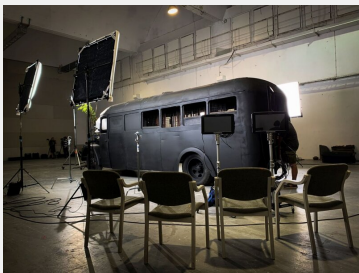
Photo from the film