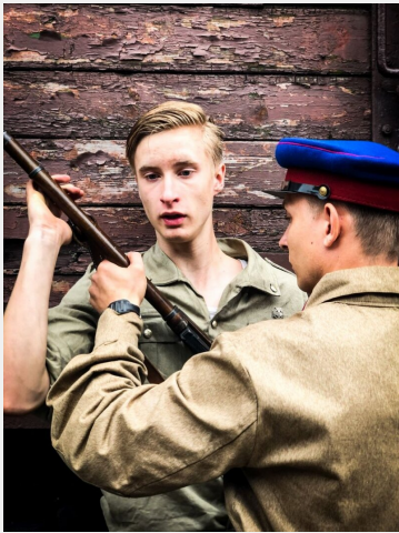
Photo from the film