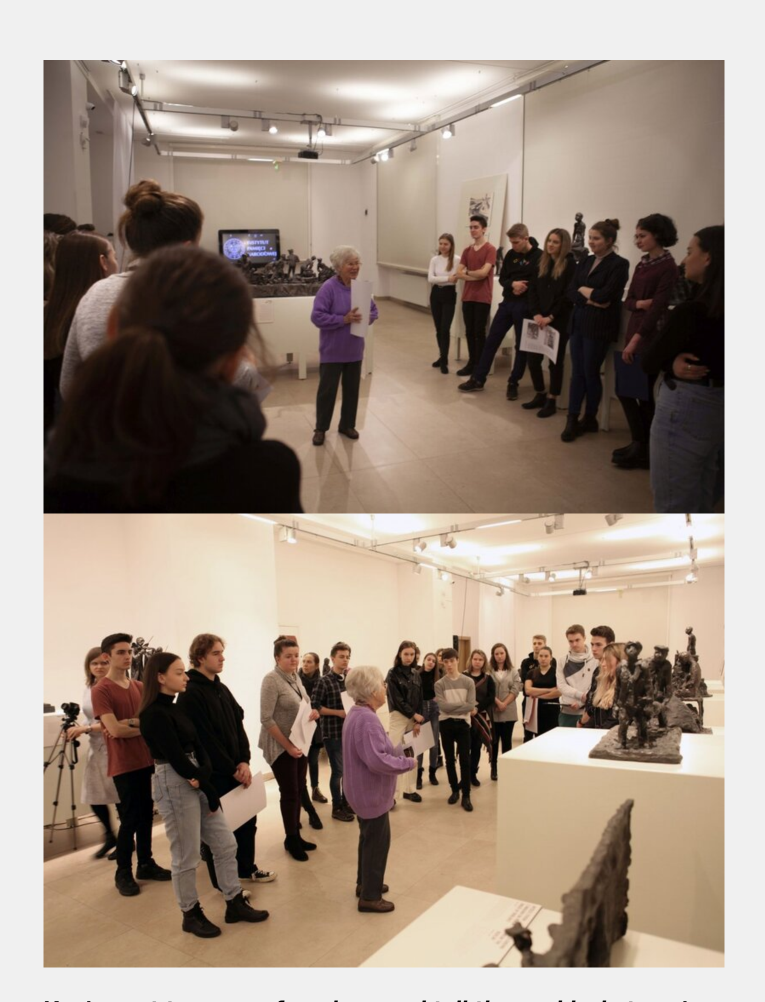
You've got to escape from here and tell the world what you've