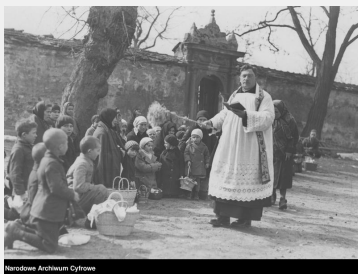
1932: blessing of food in the Polish countryside; photo: NAC, the National Digital Archive