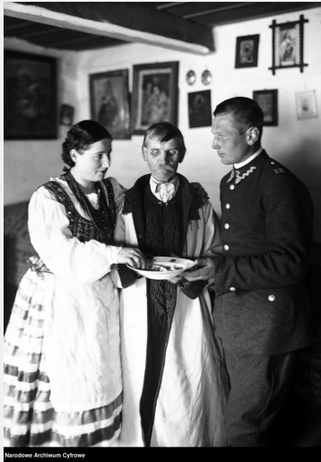
1932: a family sharing an egg