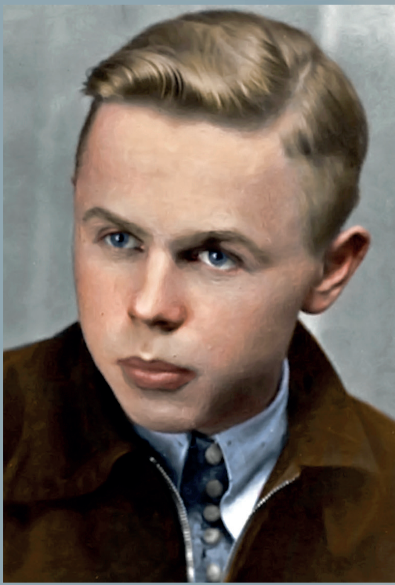
2nd Lt. Józef Szczepański pseudonym "Ziutek". Photograph: Public domain; colorization: Mikołaj Kaczmarek