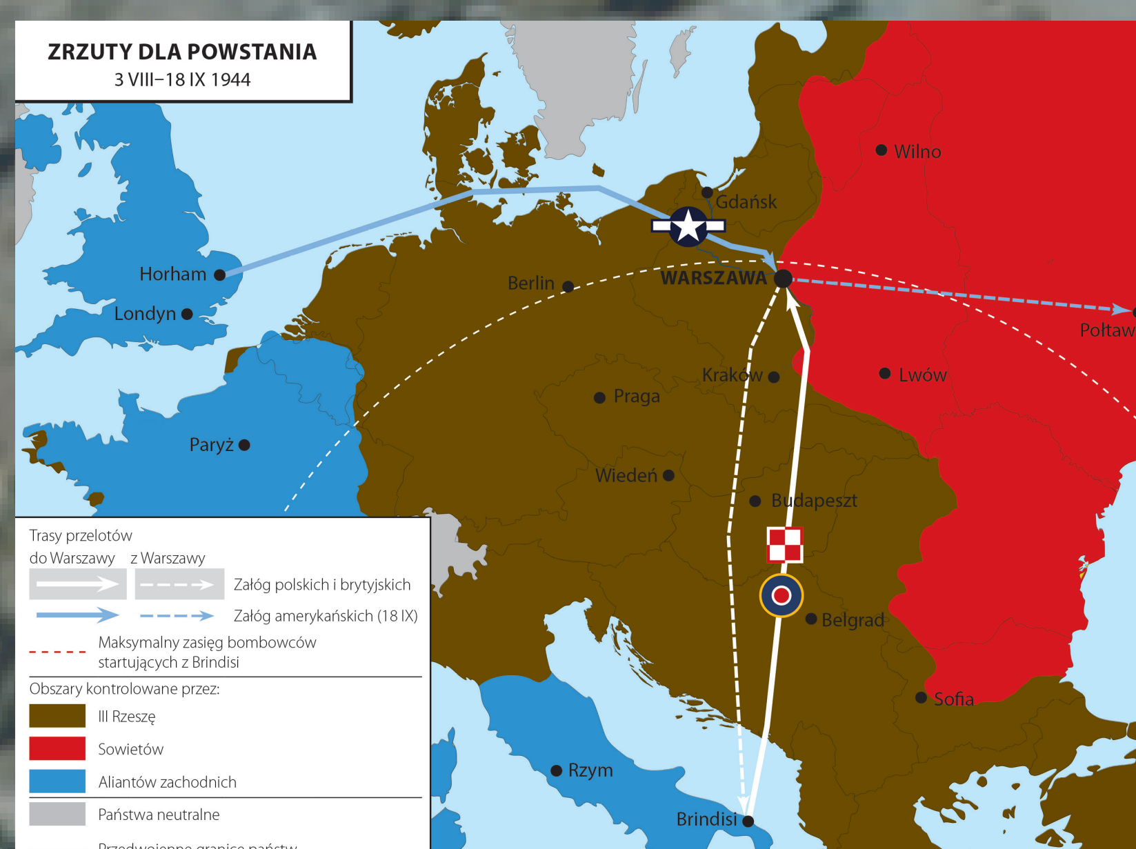
Routes of the supply planes to Warsaw.