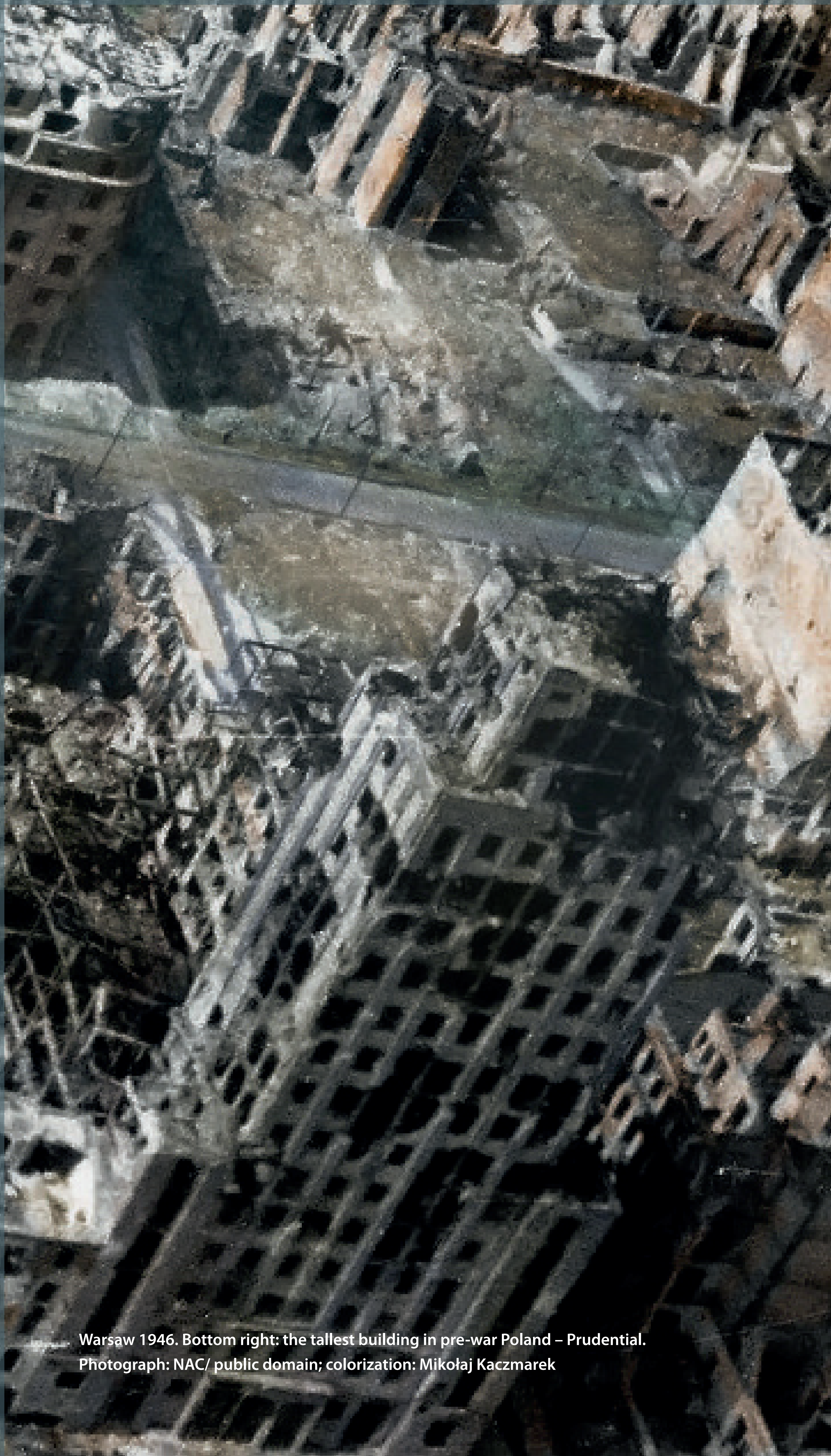
Warsaw 1946. Bottom right: the tallest building in pre-war Poland – Prudential. Photograph: NAC/ public domain; colorization: Mikołaj Kaczmarek