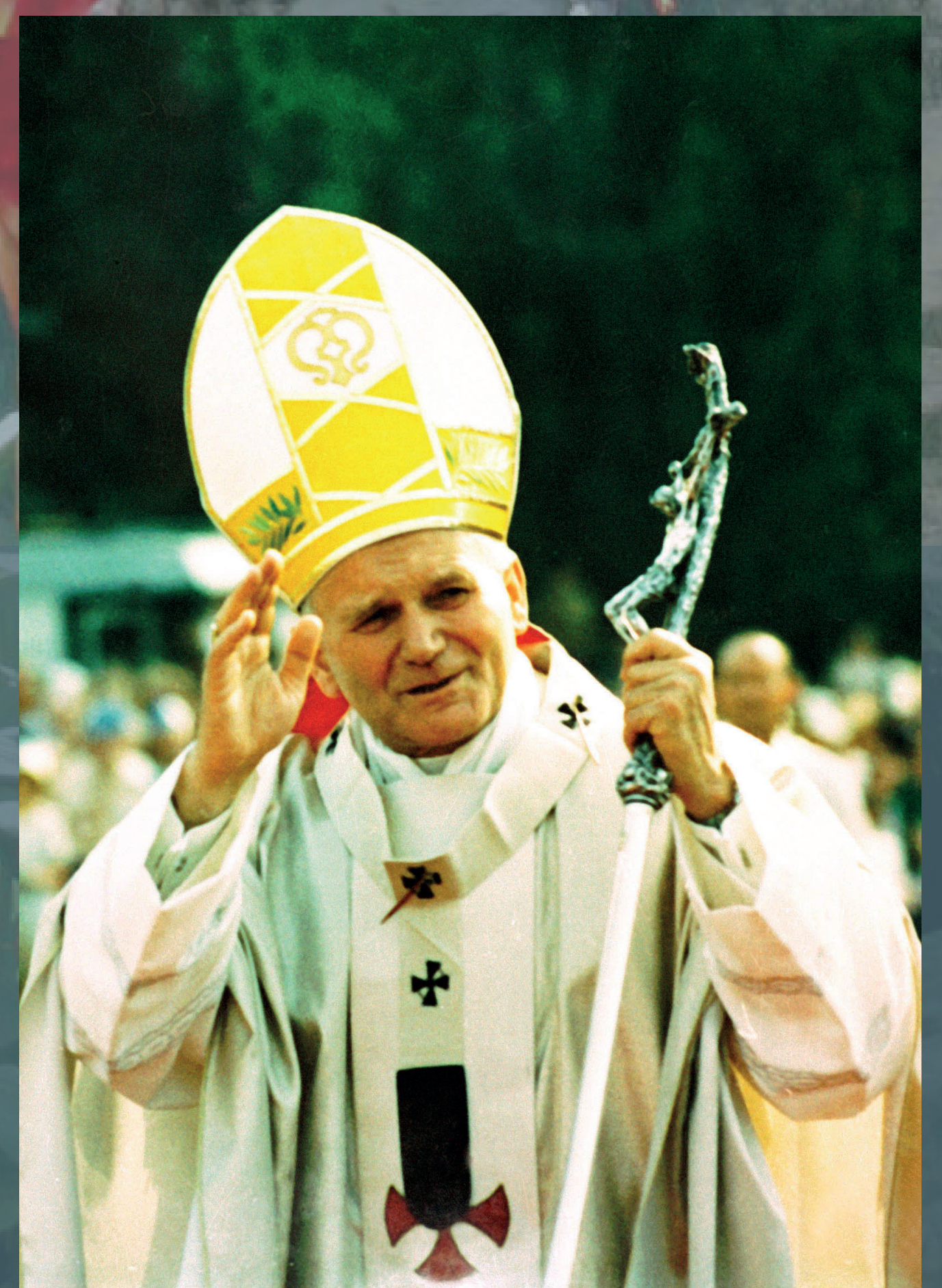
Pope John Paul II on Zwycięstwa Square Warsaw, 2 June 1979.