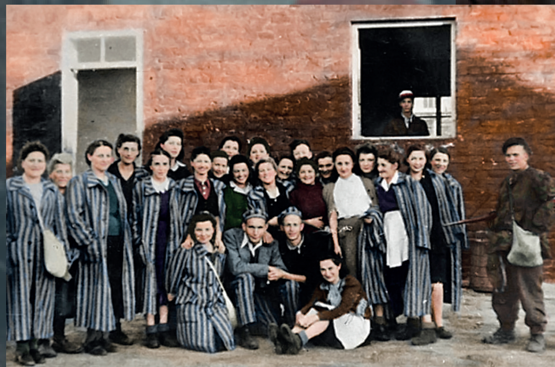
"Gesiówka" inmates with their liberators. Photograph: Juliusz B. Deczkowski/public domain; colorization: Mikołaj Kaczmarek

Photograph: public domain; colorization: Mikołaj Kaczmarek