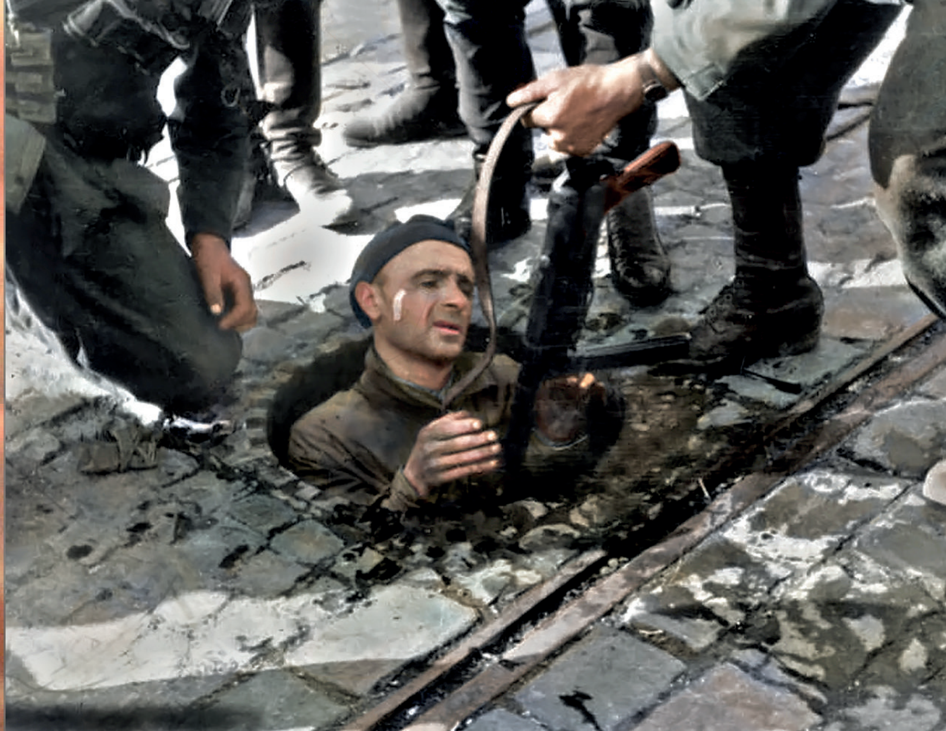
27 September 1944, a fighter leaving the sewers on Dworkowa Street in Mokotów, straight into German hands. That Day, in two executions, the Germans murdered around 140 captured Home Army soldiers who were getting out of the sewers.

(Sergeant Cadet Jerzy Zapadko pseudonym "Mirski", "Parasol" Home Army Battalion)