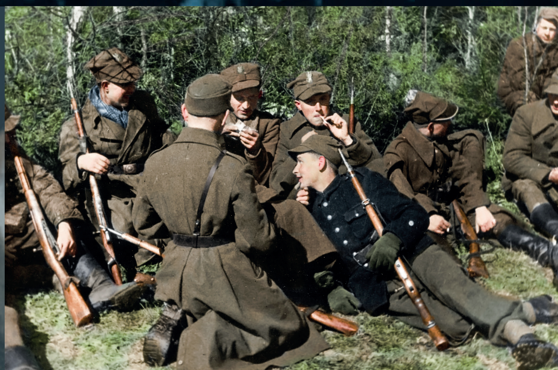
Soldiers of the 27th Home Army Infantry Division

Until October 1944, in the immediate rear of the moving frontline over 100,00 Home Army soldiers were engaged in fighting with German forces, and liberated a number of Polish towns. In the process, they were arrested by the Soviets, killed, deported to camps in Siberia or forcibly inducted into the communist army.