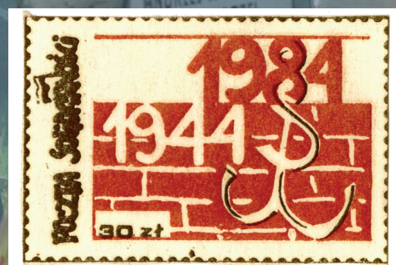
Underground stamps of Solidarity Post