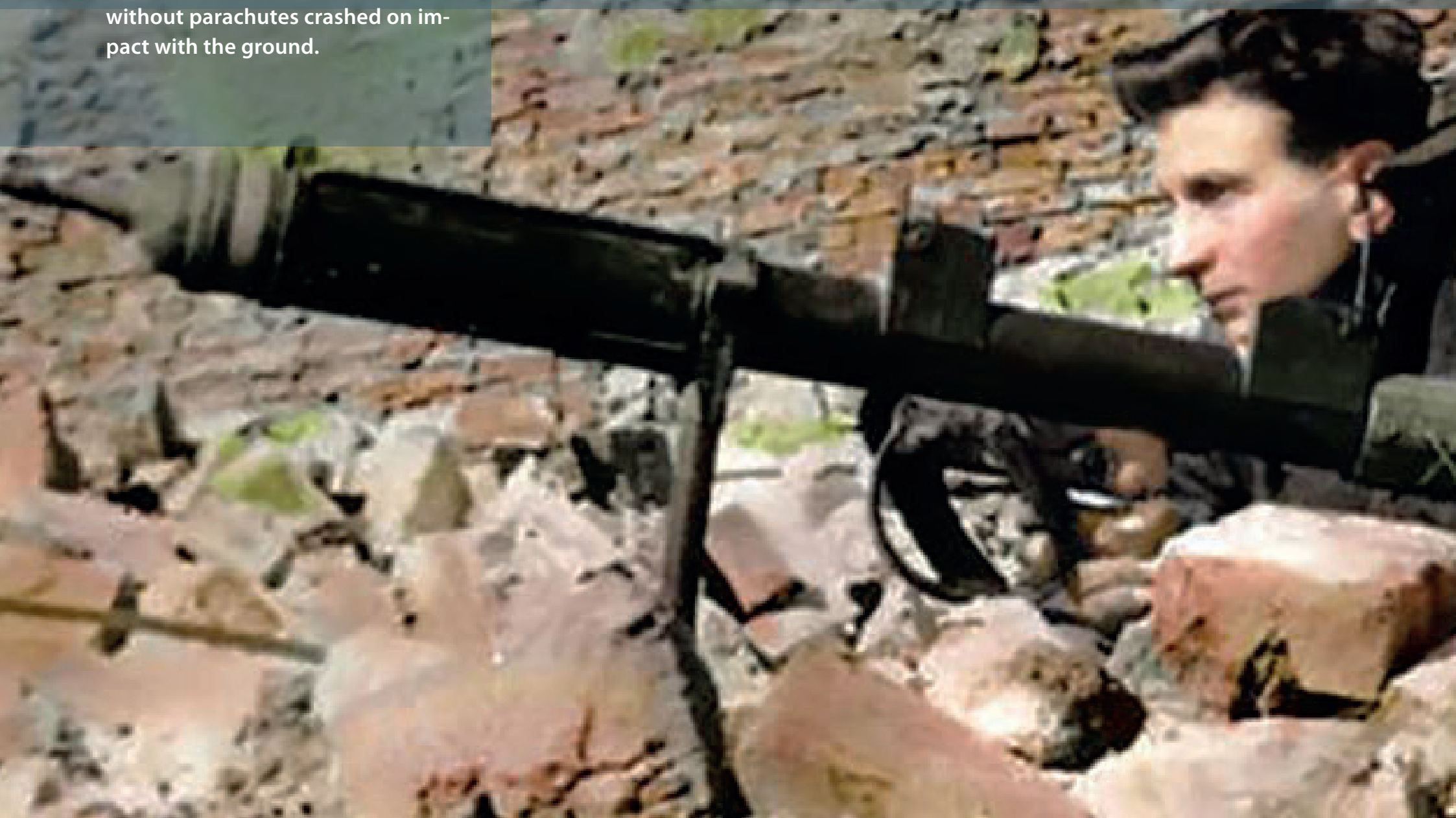
Fighters with a British anti-tank weapon, PIAT, dropped by air into Warsaw.