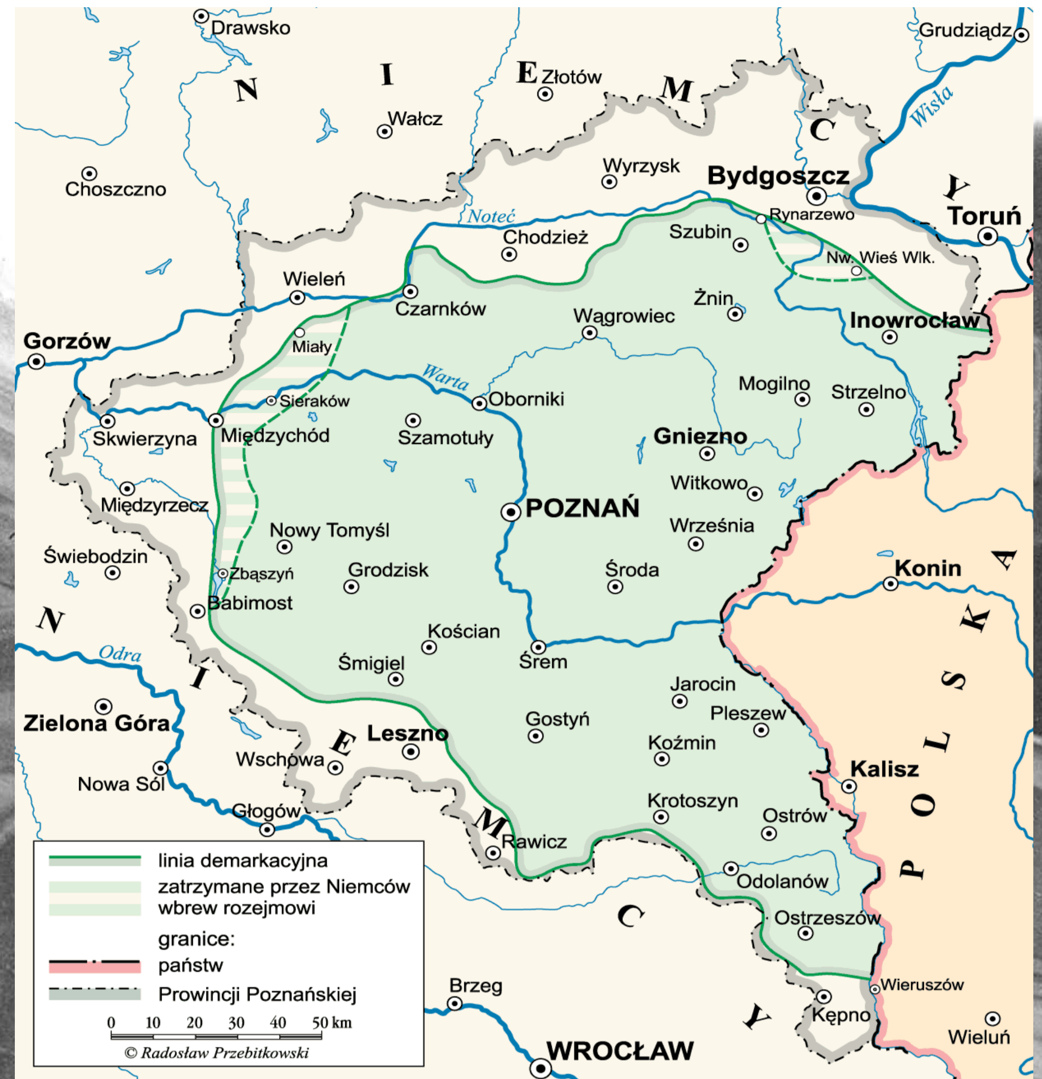
Demarcation line according to the armistice in Trier of 16th February 1919