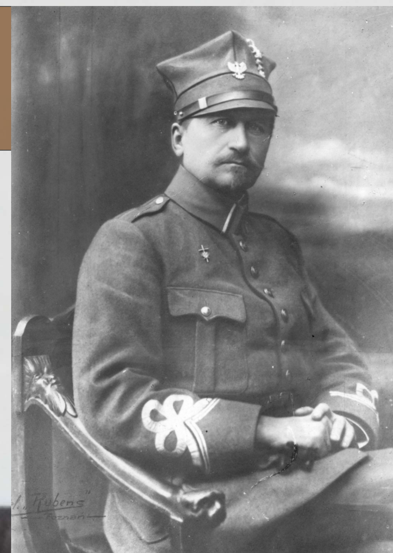
Gen. Józef Dowbor – Muśnicki (1867 – 1937). Second commander of the Greater Poland Uprising 1918/1919.

The successes in the first two weeks of the fighting did not eliminate the problems related to the voluntary form of participation in the uprising. Above all, discipline and enforcement of orders remained at a low level. The voluntary character of the units ended with the announcement of conscription to the Wielkopolska Army. Its founder was the new commander-in-chief sent from Warsaw, Gen. Józef Dowbor – Muśnicki.