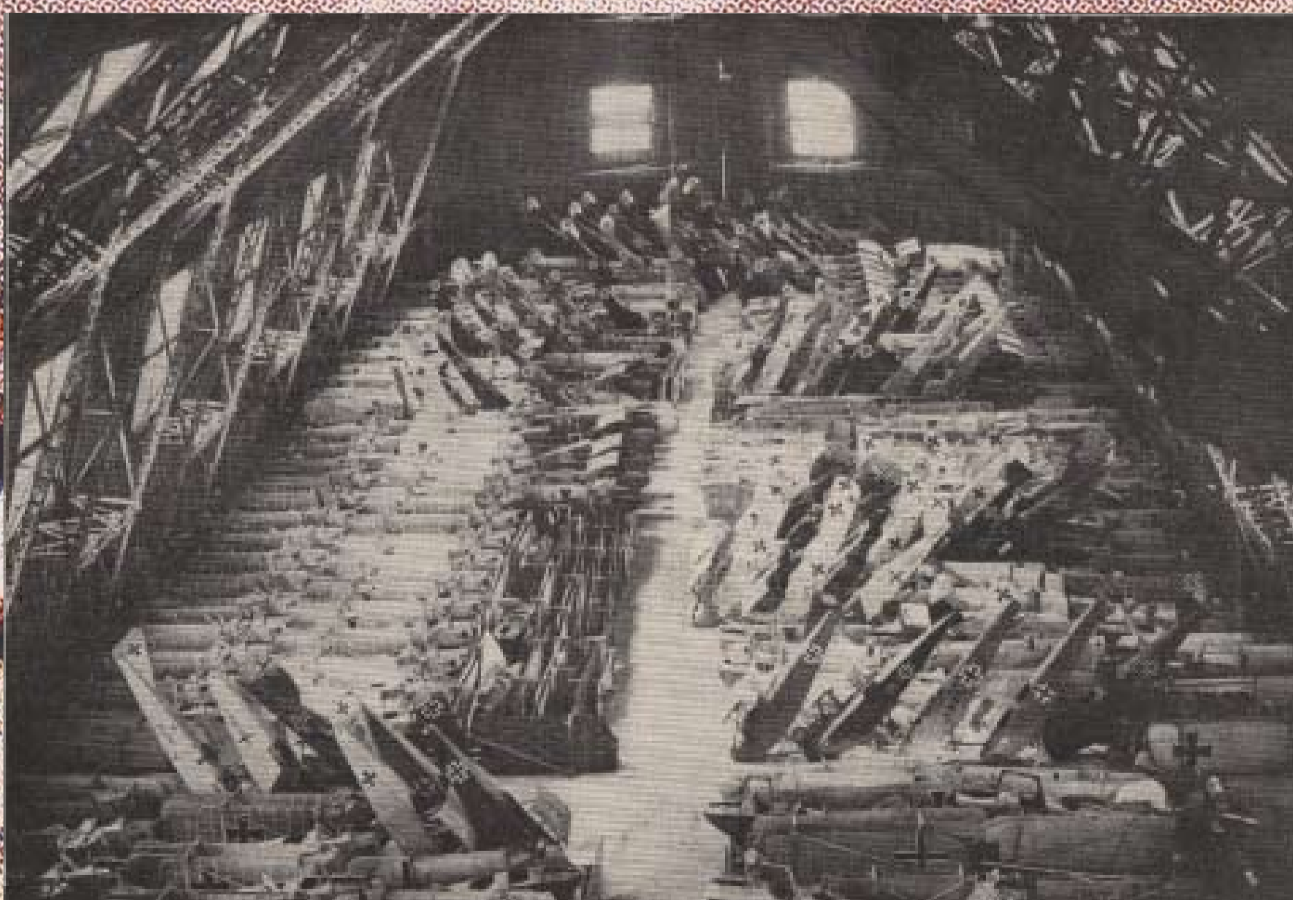
Zeppelin hall taken by the insurgents