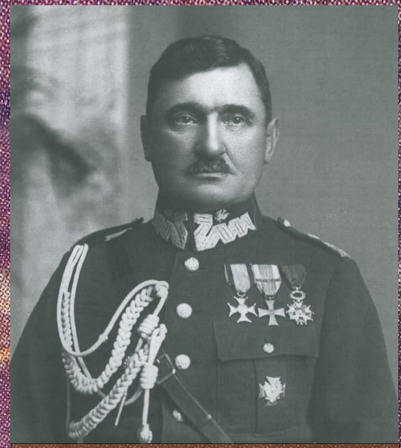
Major Stanisław Taczak (1874 – 1960) – the first commander of the Greater Poland Uprising 1918/1919 (in the photo in the general's uniform).

Within two days, practically the whole city of Poznań was taken over by the insurgent forces. The only important point not conquered during the December days was the Poznań airport on Ławica. Finally, on 6 January 1919, on the order of Major Stanisław Taczak, the first commander in chief of the uprising, this place was also taken by the insurgents through a storm.