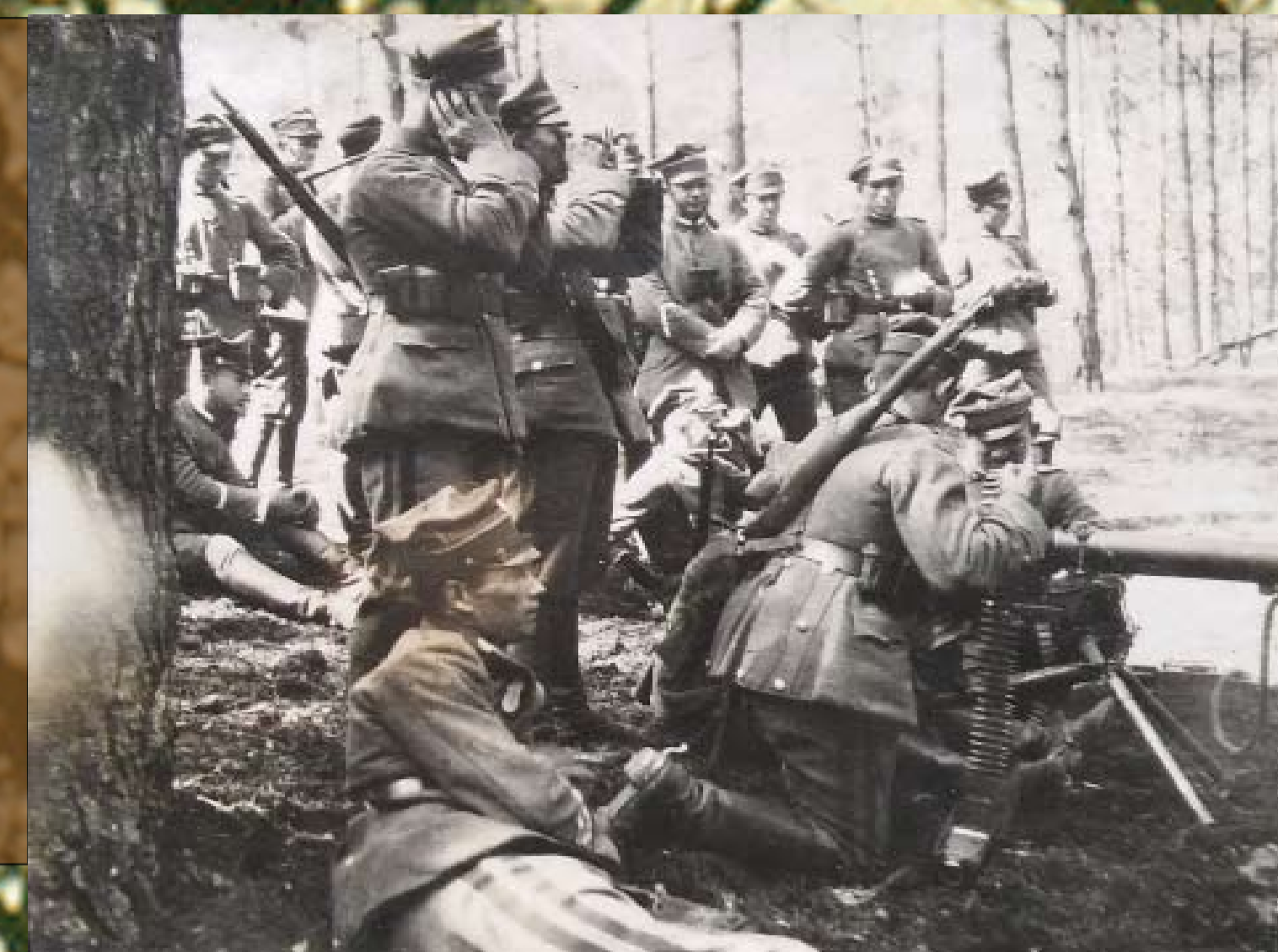
Soldiers of 1st Regiment of Greater Poland Uhlans in training, northern Wielkopolska, June 1919