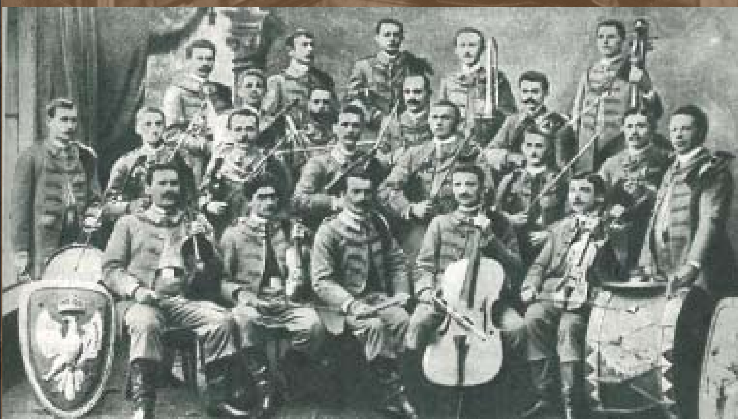
Music circle of the "Sokół" Polish Gymnastic Society in Poznań

The programme of organic work was carried out in various ways, through self-education, scientific, craft, religious and sports societies, as well as parish agricultural circles or Polish cooperatives and Polish banking systems.