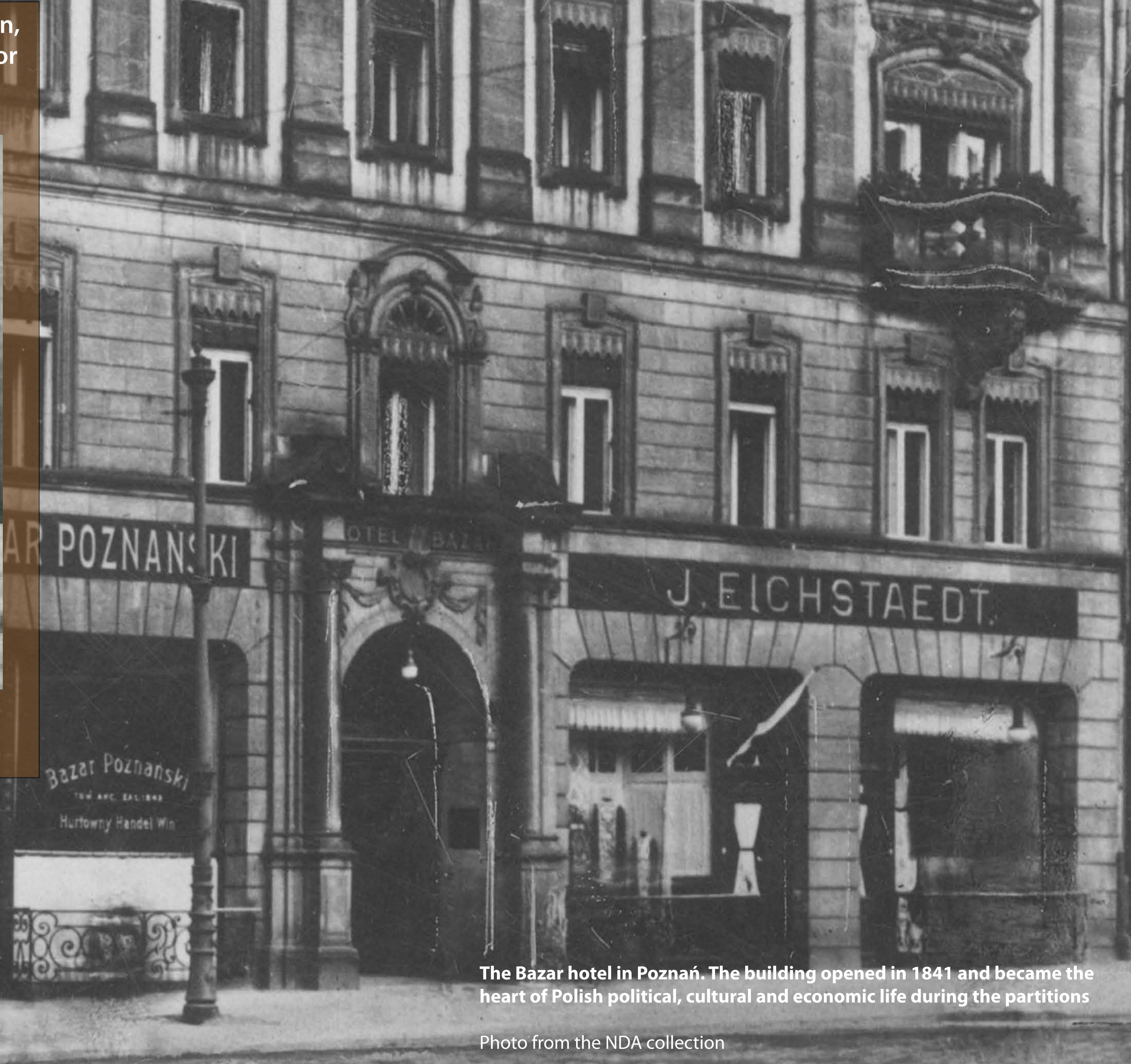
The Bazar hotel in Poznań. The building opened in 1841 and became the heart of Polish political, cultural and economic life during the partitions