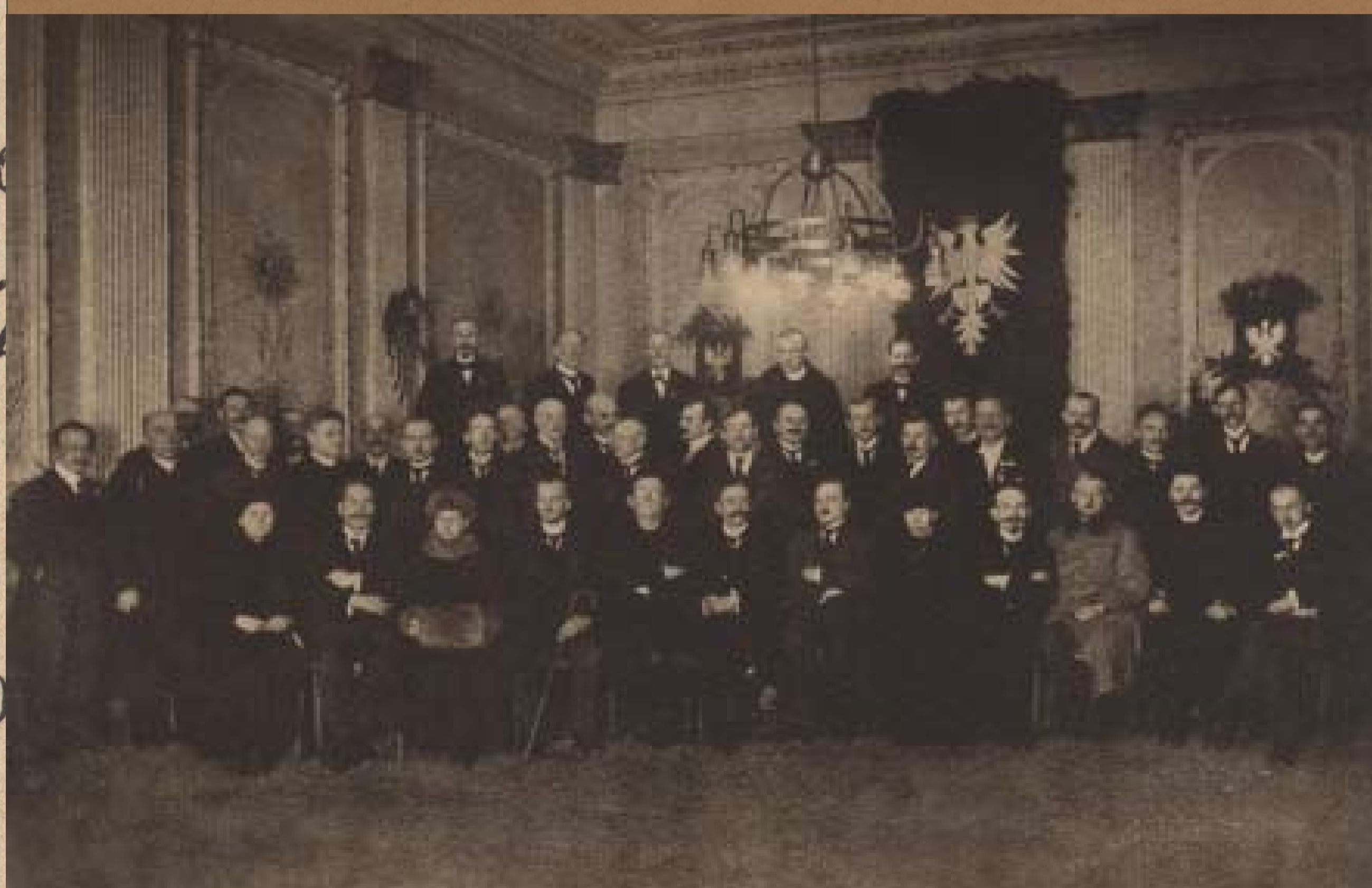
The Supreme People's Council.

The armistice signed on 11th November 1918, which ended World War I, left the Province of Poznań within the borders of the German Republic. The related disappointment among the Polish population, however, did not stop the independence aspirations of Poles. The chaos and disorientation that prevailed in the German state as a result of the revolution and abdication of the Emperor Wilhelm II, was conducive to Polish goals.