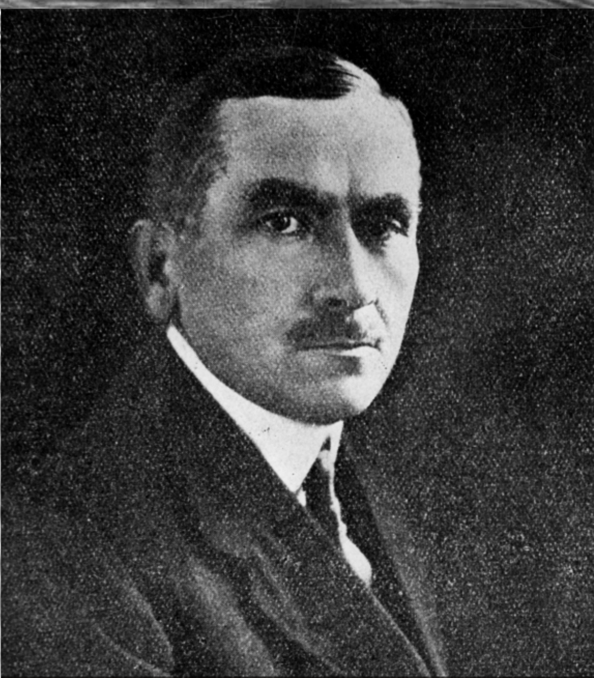
Roman Dmowski (1864 – 1939). Polish delegate to the 1919 Paris Conference and signatory of the Versailles Peace Treaty. He sought to incorporate the lands of the Prussian partition into the reborn Poland.