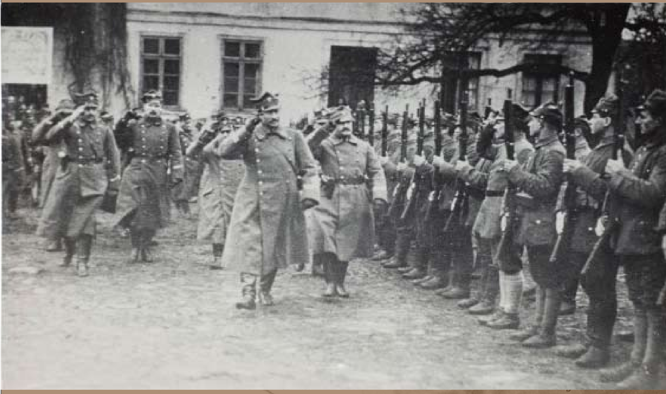
Capturing Zbąszyń as part of the revindication action, January 1920.