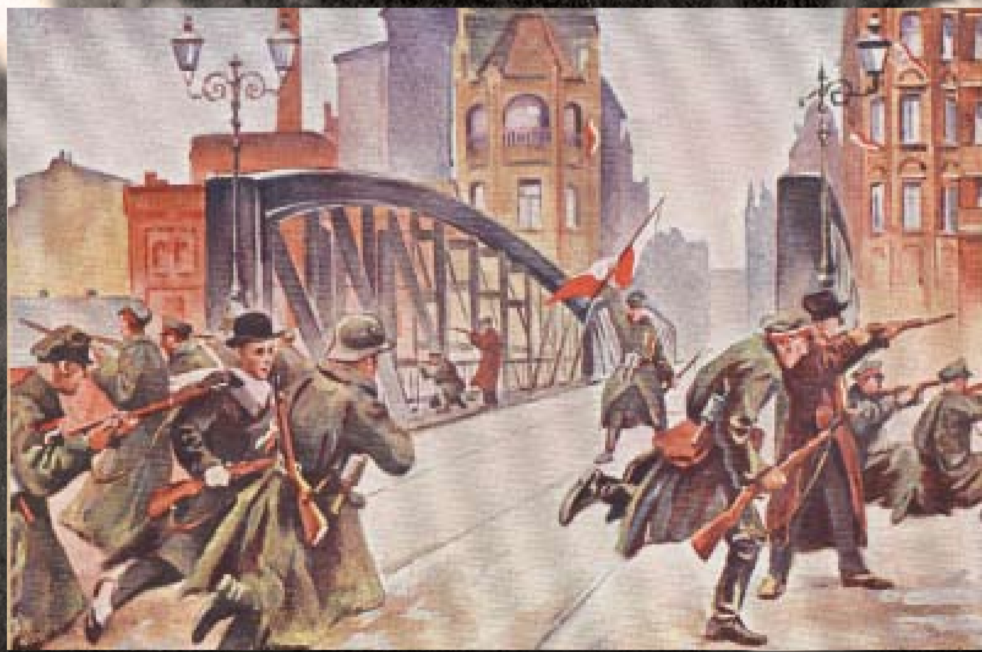
Fights at the Chwaliszewski Bridge in Poznań, 27th December 1918

The meeting in the afternoon in front of the Bazaar of both demonstrations (without the participation of children) is considered as the beginning of the uprising. The first shot was fired in the crowd. Its consequence will be start of fights in Poznań.