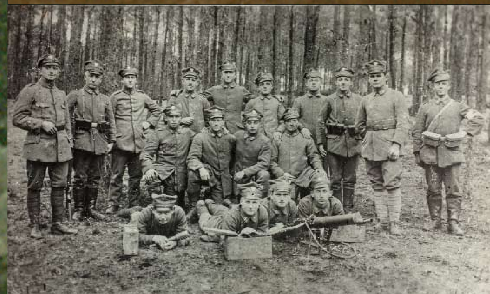
Platoon of 4th Battery under Wielki Grójec (western front), February 1919.