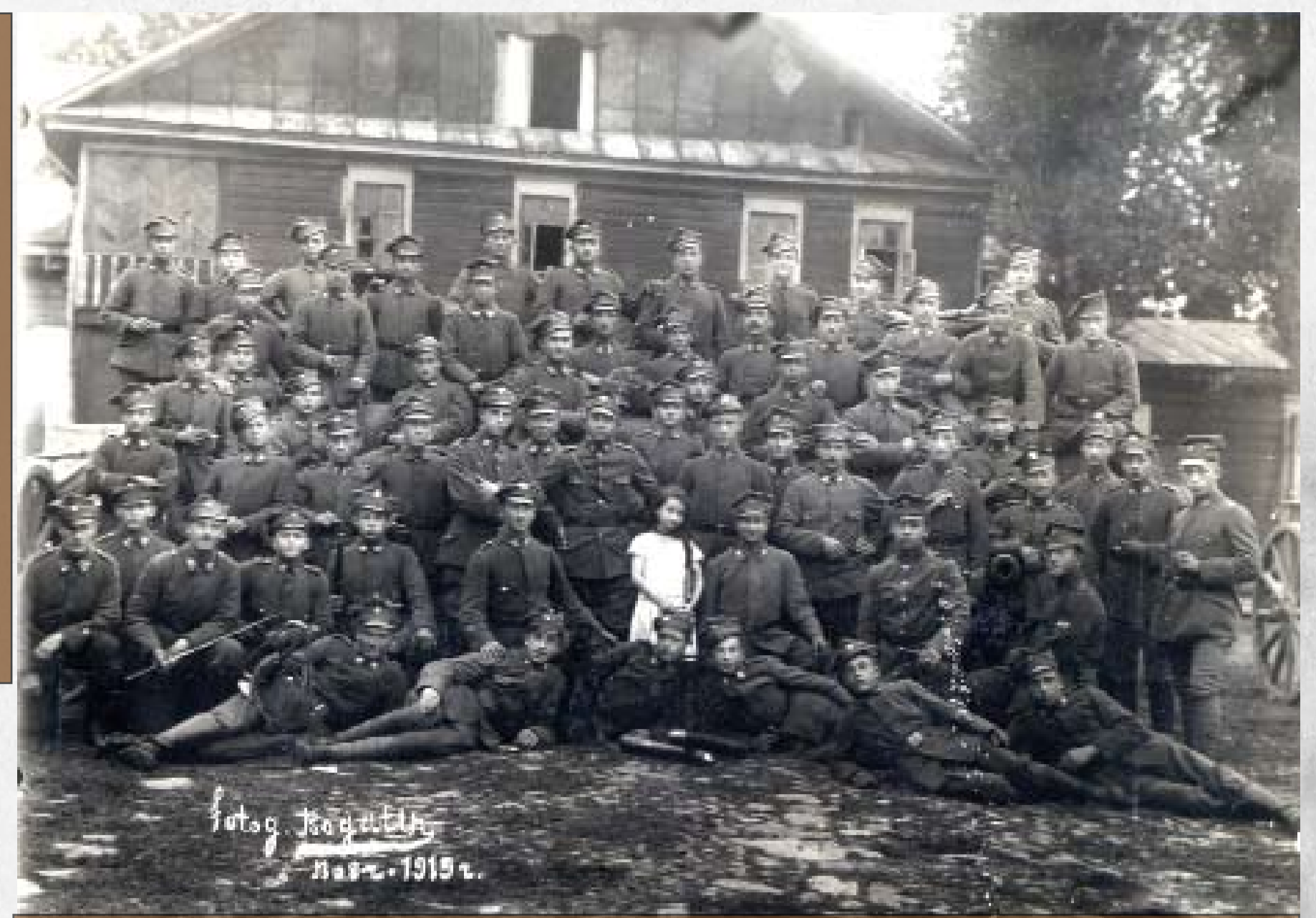
4th battery of the 3rd Regiment of Wielkopolska Riflemen on the front of the Polish - Bolshevik war, Bobrujsk 1919.

It is estimated that the percentage share in the armed troops of Poles from the Poznań Province reached even 16%. About 2 thousand of them died in fights.