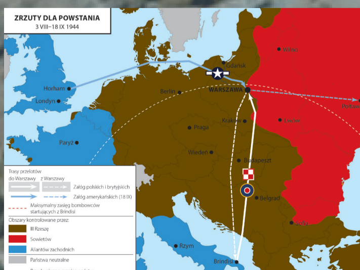
Routes of the supply planes to Warsaw.