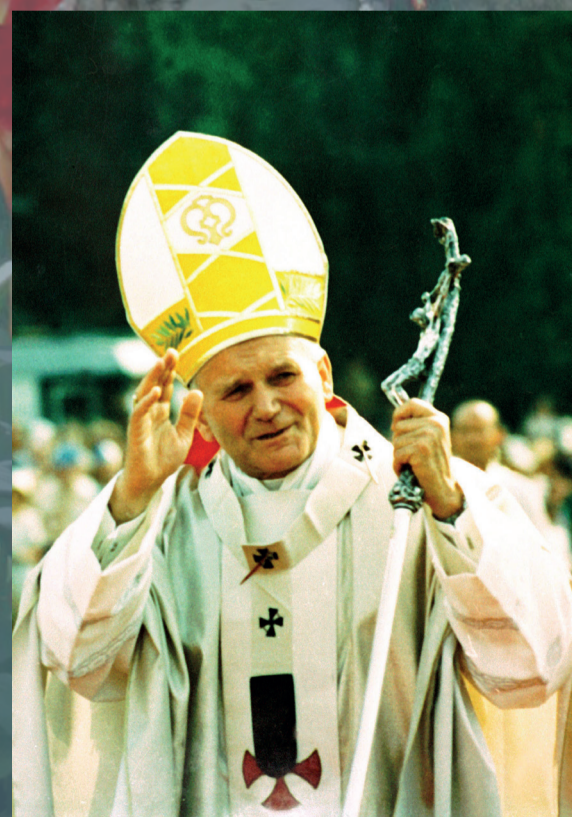
Pope John Paul II on Zwycięstwa Square Warsaw, 2 June 1979. Photograph: PAP