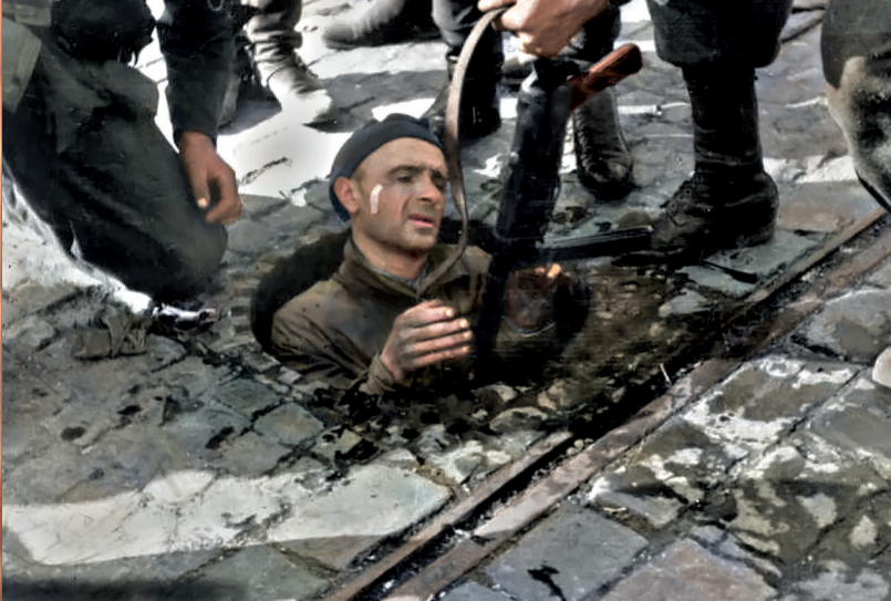
27 September 1944, a fighter leaving the sewers on Dwor-kowa Street in Mokotów, straight into German hands. That Day, in two executions, the Germans murdered around 140 captured Home Army soldiers who were getting out of the sewers. Photograph: Bundesarchiv CC-BY-3.0; colorization: Mikołaj Kaczmarek

(Sergeant Cadet Jerzy Zapadko pseudonym "Mirski", "Parasol" Home Army Battalion)