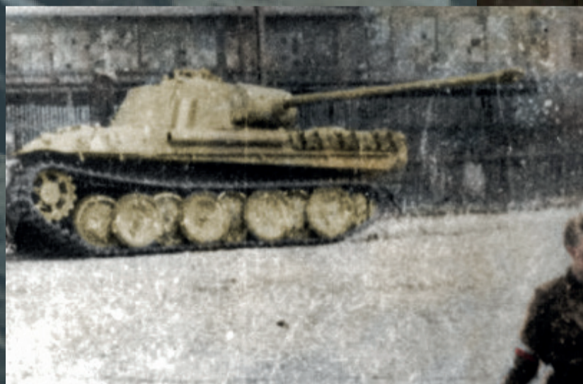
"Magda" tank captured by the fighters, one of the chief protagonists of "Gesiówka" liberation. Together with another tank, Marked "WP" was used by the autonomous "Wacek" armored platoon, an element of the "Zoska" Home Army Battalion.