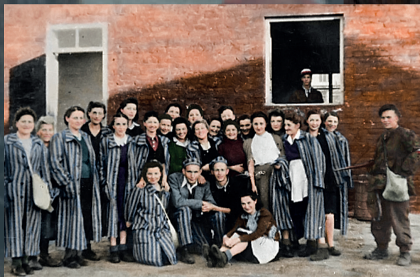
"Gesiówka" inmates with their liberators. Photograph: Juliusz B. Deczkowski/public domain; colorization: Mikołaj Kaczmarek

Photograph: public domain; colorization: Mikołaj Kaczmarek