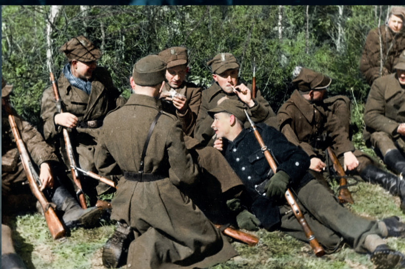
Soldiers of the 27th Home Army Infantry Division

Until October 1944, in the immediate rear of the moving frontline over 100,00 Home Army soldiers were engaged in fighting with German forces, and liberated a number of Polish towns. In the process, they were arrested by the Soviets, killed, deported to camps in Siberia or forcibly inducted into the communist army.