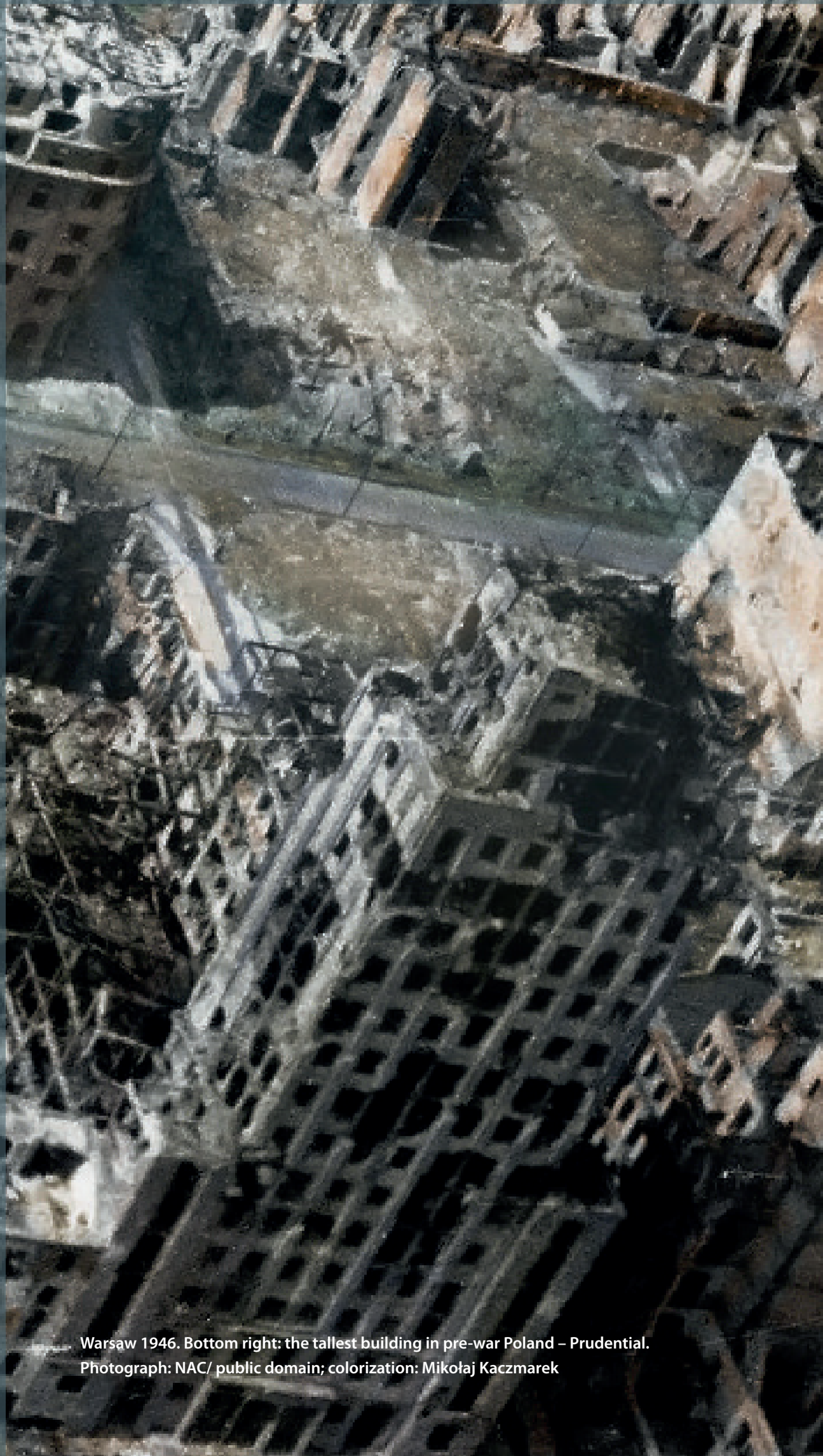
Warsaw 1946. Bottom right: the tallest building in pre-war Poland – Prudential. Photograph: NAC/ public domain; colorization: Mikołaj Kaczmarek