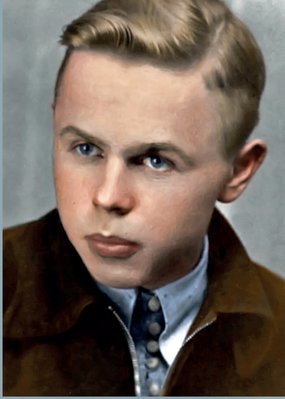
2nd Lt. Józef Szczepański pseudonym "Ziutek". Photograph: Public domain; colorization: Mikołaj Kaczmarek