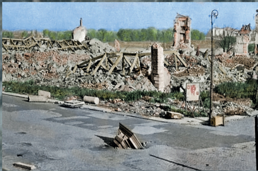
Ruins of the Royal Castle in Warsaw blown up after the fall of the Uprising by the Germans. In the foreground: fragment of King Sigismund column Photograph: Marcin Wolagiewicz/ public domain; colorization: Mikołaj Kaczmarek