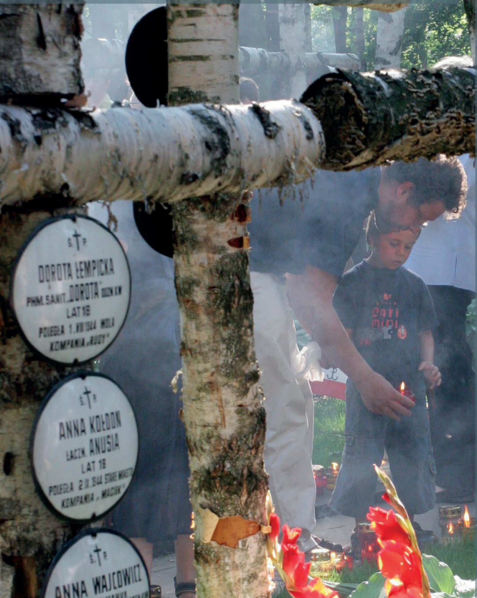
1 August 2005 on Powązkowski Cemetery, Warsaw.

It is impossible to understand this city, Warsaw, the capital of Poland, that undertook in 1944 an unequal battle against the aggressor, a battle in which it was abandoned by the allied powers, a battle in which it was buried under its own ruins — if it is not remembered that under those same ruins there was also the statue of Christ the Savior with his cross that is in front of the church at Krakowskie Przedmieście. It is impossible to understand the history of Poland from Stanislaus in Skalka to Maximilian Kolbe at Oswiecim, unless we apply to them that same single fundamental criterion that is called Jesus Christ.