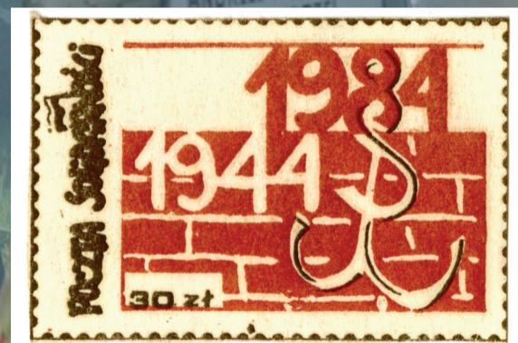
Underground stamps of Solidarity Post