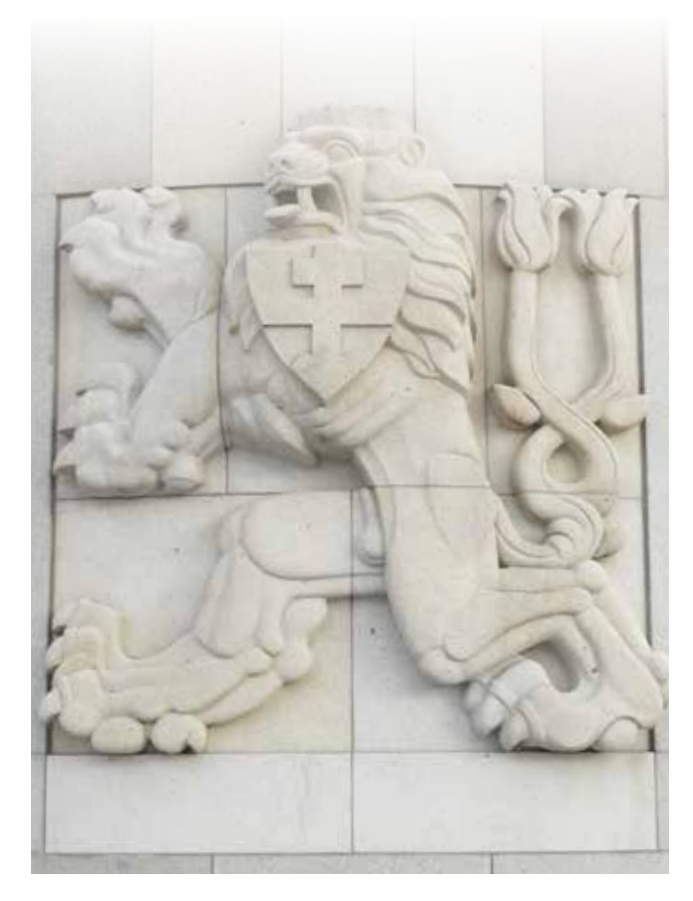
Czechoslovak Arms on the Vitkov Monument. Prague, Czech Republic. 2019.

"blank spots" in the country's history. These attitudes were also exemplified by the high quality of oeuvres inspired by Czech history, which also fulfil a valuable educational function. On the other hand, such an approach leads to institutional weakness while offering reduced possibilities for transmitting historical accounts to society as a whole. In recent years, we have, however, witnessed a trend toward an increasingly visible presence of the state in this domain; yet time will soon tell whether this tendency is likely to transform into a permanent phenomenon and what fruits it will eventually bear. Thus far, buildings of such renowned institutions as the National Museum, the Military History Museum or the Institute for the Study of Totalitarian Regimes are all covered with scaffolding symbolising the transition stage of the Czech politics of history.