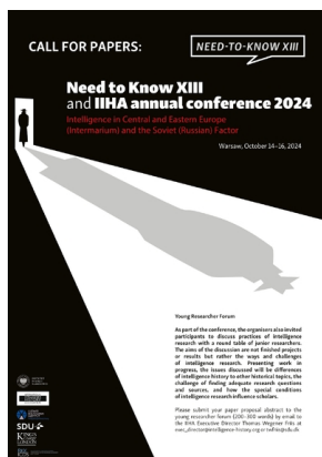
CALL FOR PAPERS: International Conference Need to Know XIII and the 2024 IIHA Annual Conference: Intelligence in Central

The conference is jointly organised by the Institute of National Remembrance – Commission for the Prosecution of Crimes against the Polish Nation (Warsaw, Poland) and the International Intelligence History Association (IIHA) together with the Center for Cold War Studies of the University of Southern Denmark; King's Centre for the Study of Intelligence, King's College London (UK); International Center for Defence and Security (Tallin, Estonia), Ludwig Boltzmann Institute for the Research on Consequences of War (Graz, Austria), and in partnership with the International Journal of Intelligence and Counterintelligence.