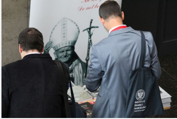
"The Pope from Behind the Iron Curtain" conference - Cracow, 9 October 2018.