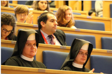
"The Pope from Behind the Iron Curtain" conference - Cracow, 9 October 2018.