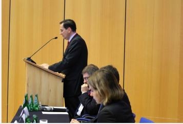
"The Pope from Behind the Iron Curtain" conference - Cracow, 9 October 2018.