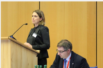
"The Pope from Behind the Iron Curtain"