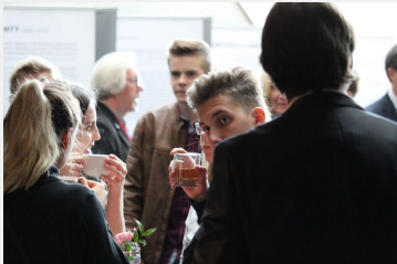
"The Pope from Behind the Iron Curtain" conference - Cracow, 9 October 2018.