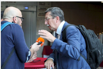
"The Pope from Behind the Iron Curtain"