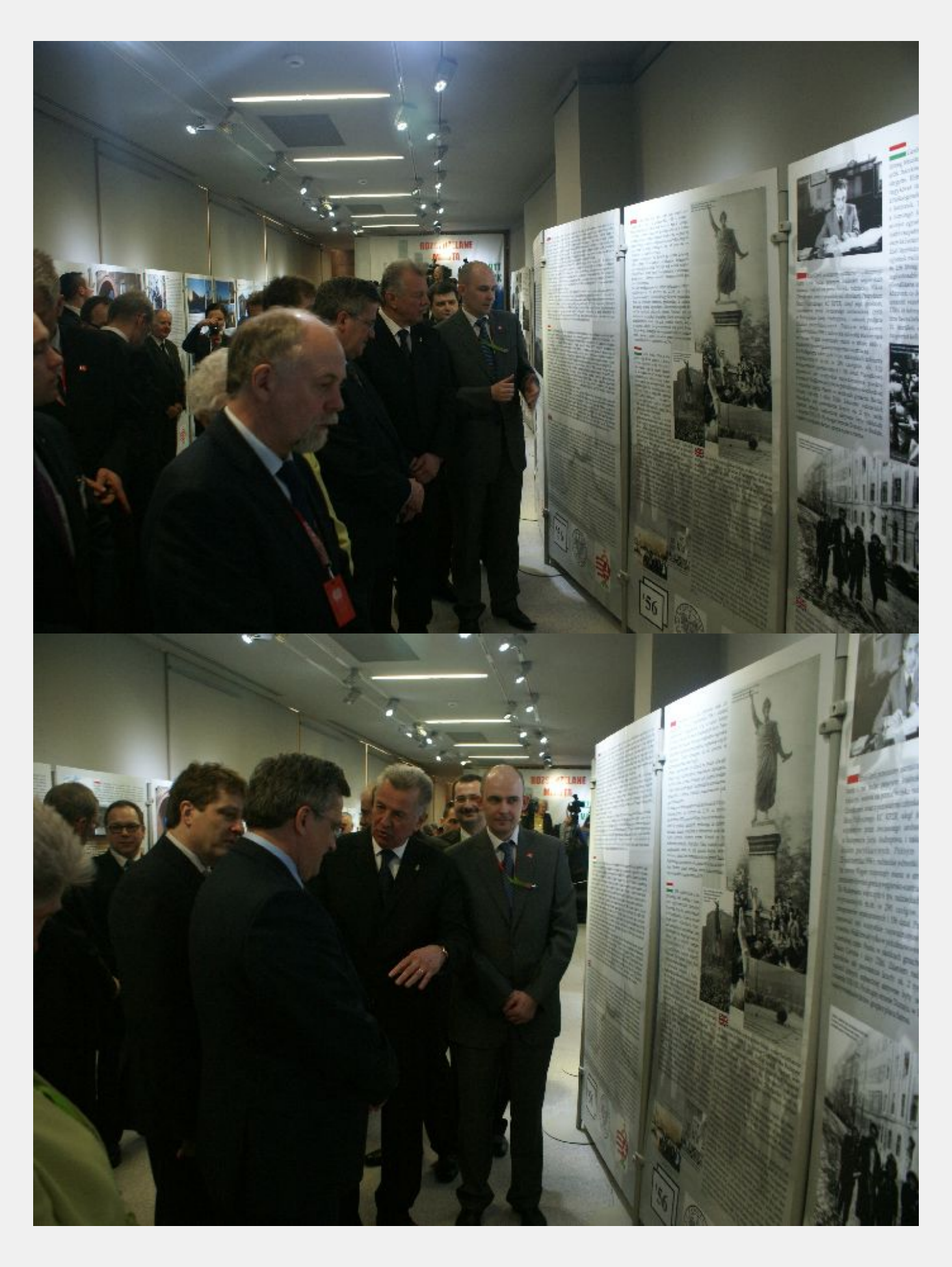
The city of Poznań was the host of this year's VI Days of Polish-