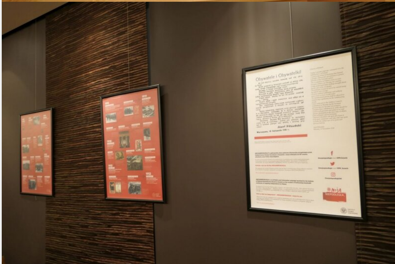
An official Gala on the occasion of the 100th anniversary of