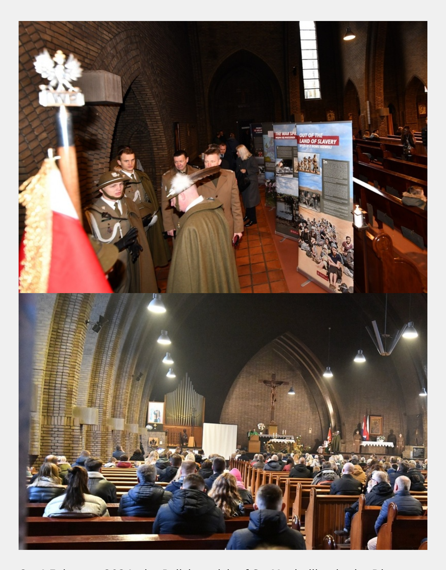
On 4 February 2024, the Polish parish of St. Maximilian in the Diocese of Breda held a commemoration ceremony for the Polish Independent