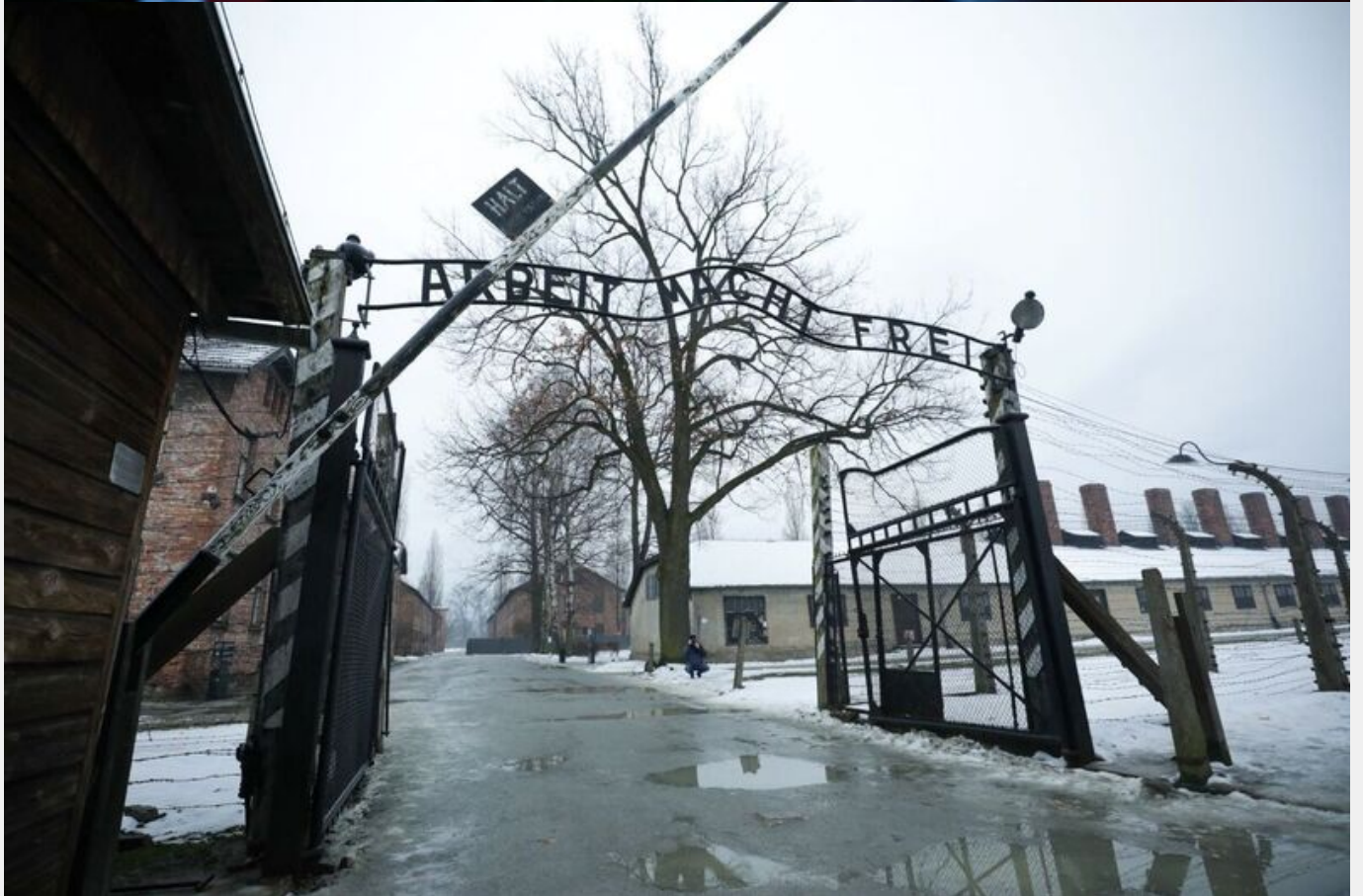
The memory of Auschwitz victims was commemorated during the 5th