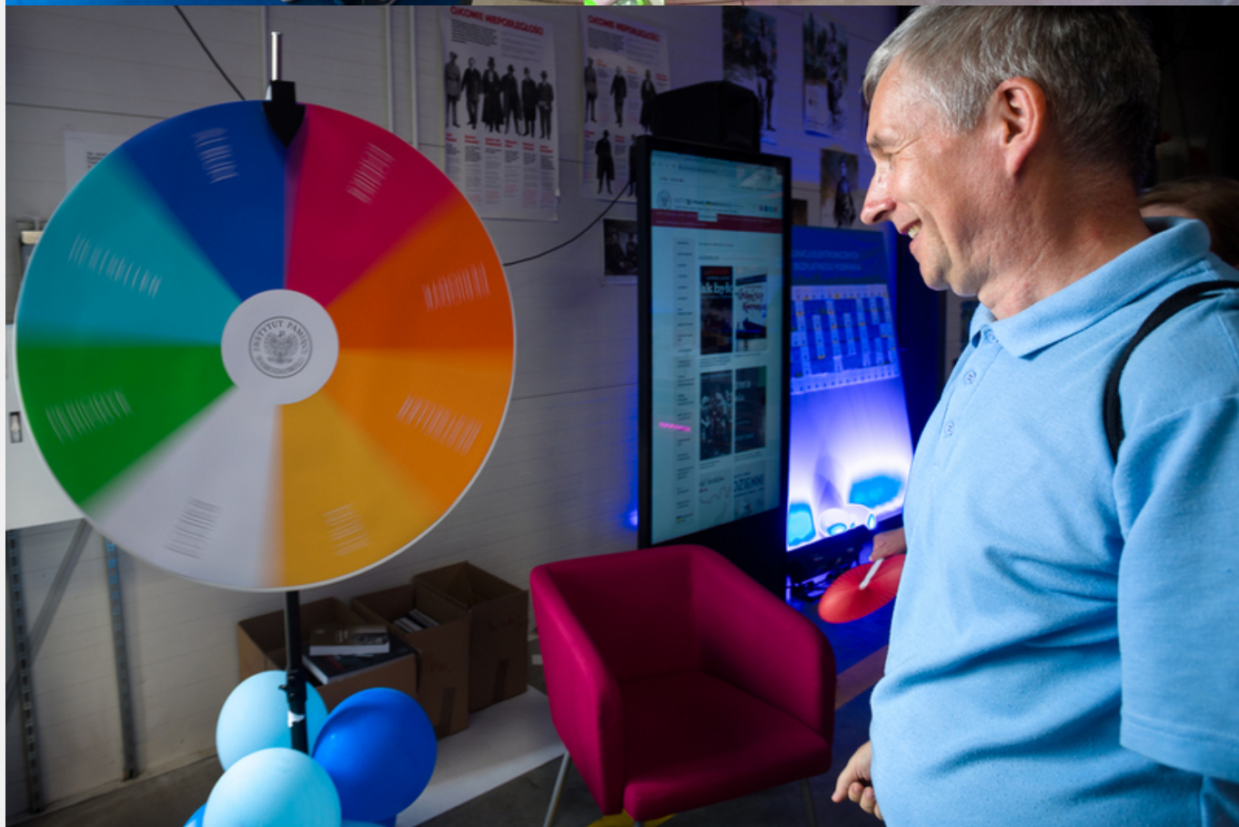
On 19 August we launched a great book festival held at the warehouse