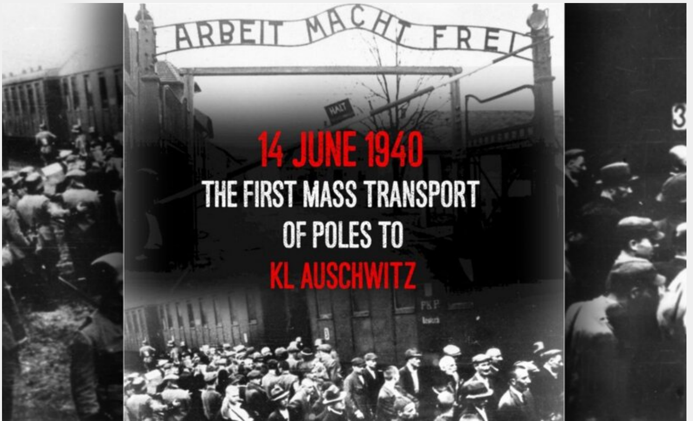
The first transport to Auschwitz commemoration image