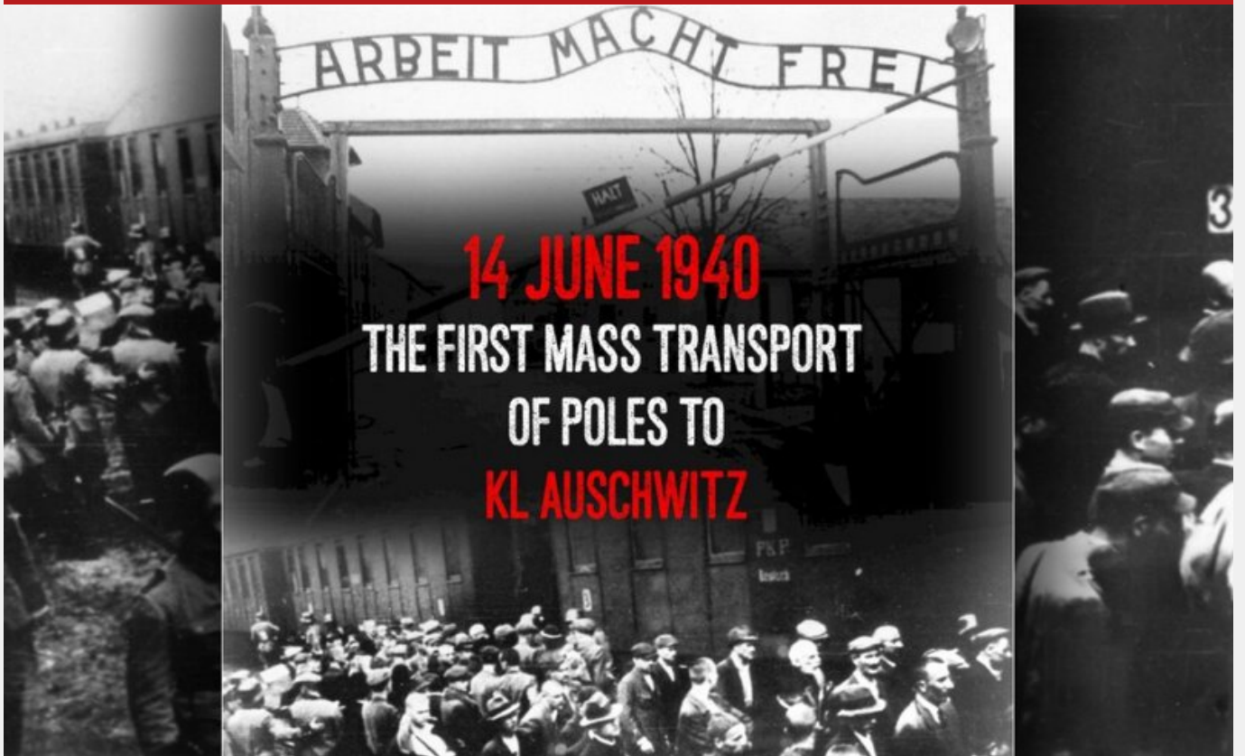
The first transport to Auschwitz commemoration image