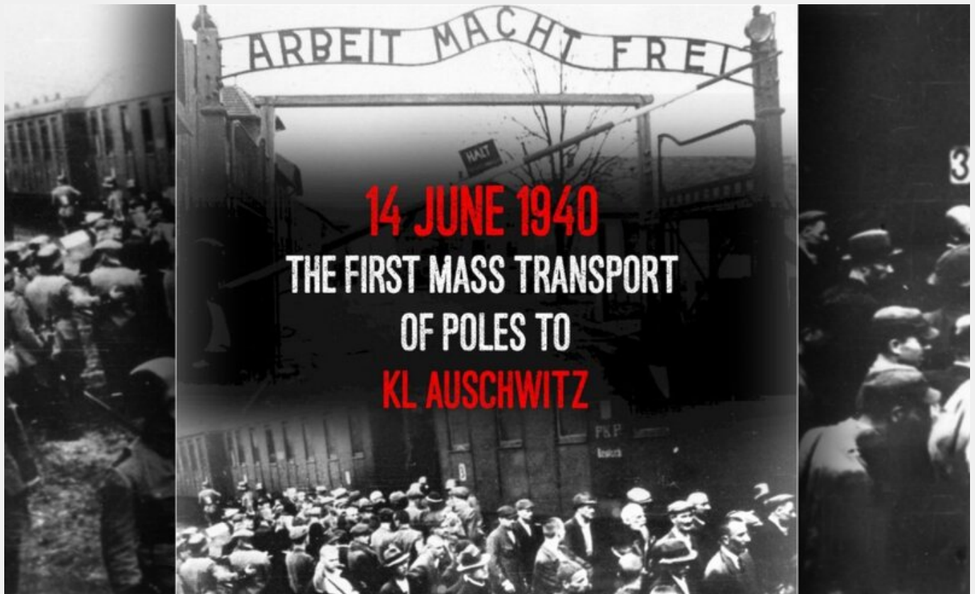
The first transport to Auschwitz commemoration image