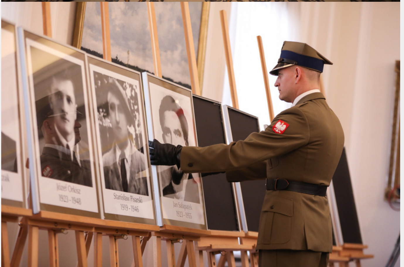
During a special ceremony, the relatives of 20 people murdered as a